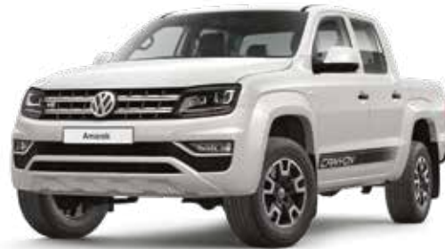
~ Candy White | Solid | B4B4