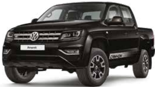
* Deep Black | Pearl effect | 2T2T