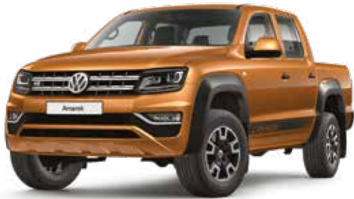
~ Outback Orange | Metallic paint finish | 4V4V (Only available with black flares)