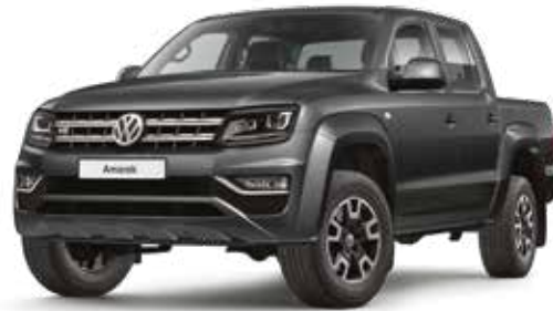
* Indium Grey | Metallic paint finish | X3X3