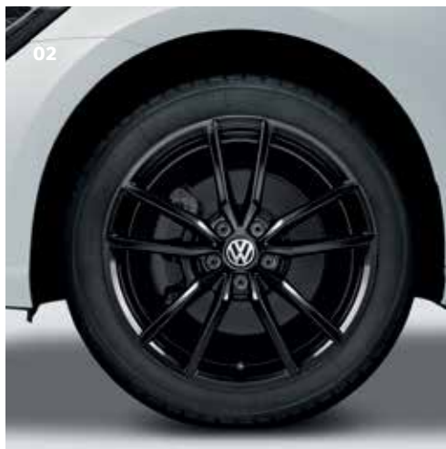
02 Pretoria, alloy wheel 18 inch, Black gloss Part. no. 5G0071498AAX1