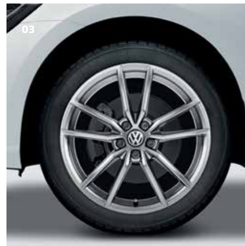
03 Pretoria, alloy wheel 18 inch, Sterling silver Part. no. 5G0071498A88Z