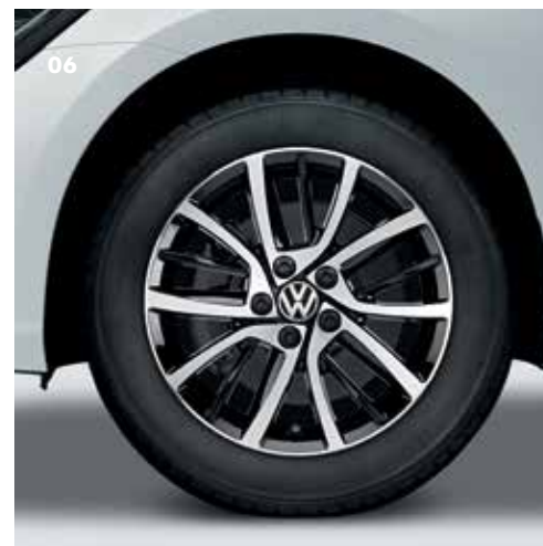
06 Blade, alloy wheel 17 inch, Black gloss machined Part. no. 5G0071497FZZ