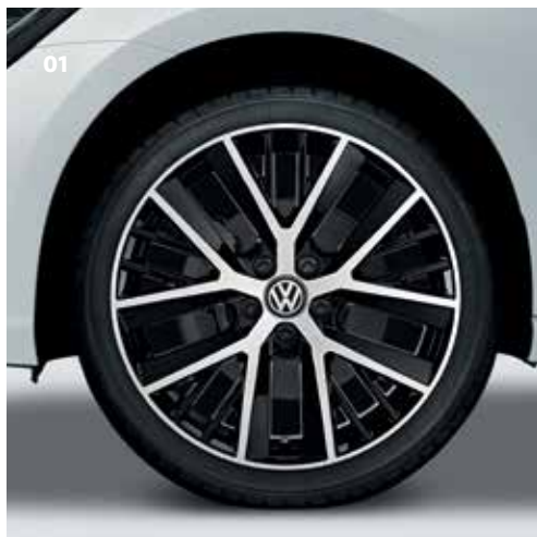
01 Twinspoke, alloy wheel 19 inch, Black gloss machined Part. no. 5G0071499FZZ