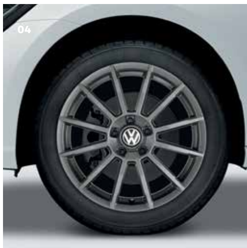
04 Rotary, alloy wheel 18 inch, Anthracite Part. no. 5G007149816Z