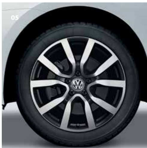
05 Serron, alloy wheel 18 inch, Black gloss machined Part. no. 5K0071498BAX1