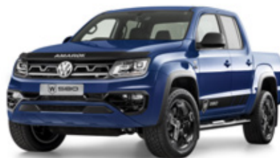
Ravenna Blue (PE)*