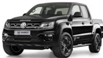
Deep Black (MP)*