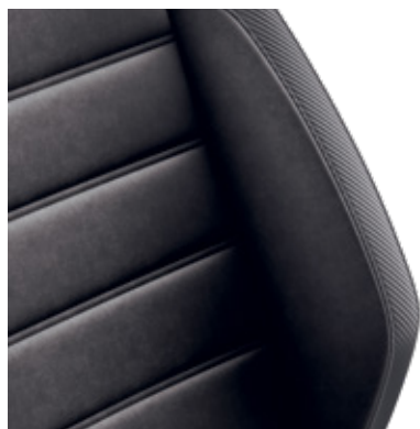
Art Velour Trim

Two-colour microfleece seat upholstery in Palladium/Titanium Black