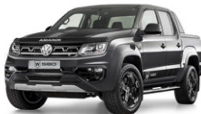
Indium Grey (PE)