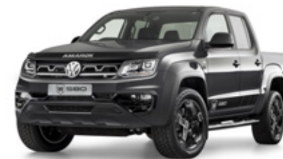
Indium Grey (MP)*