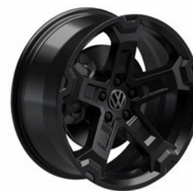
20" x 9" forged 'Clayton' Alloy Wheels

Two-colour Vienna Leather# upholstery in Palladium Grey /Titanium Black