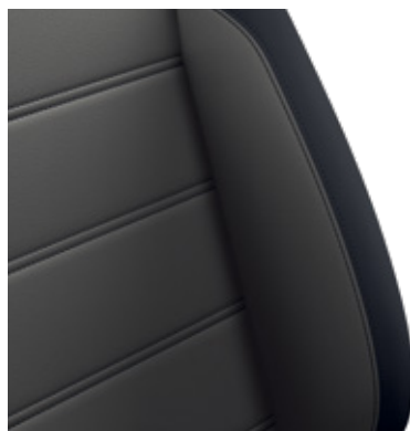
Vienna Leather# Trim

Two-colour microfleece seat upholstery in Palladium/Titanium Black