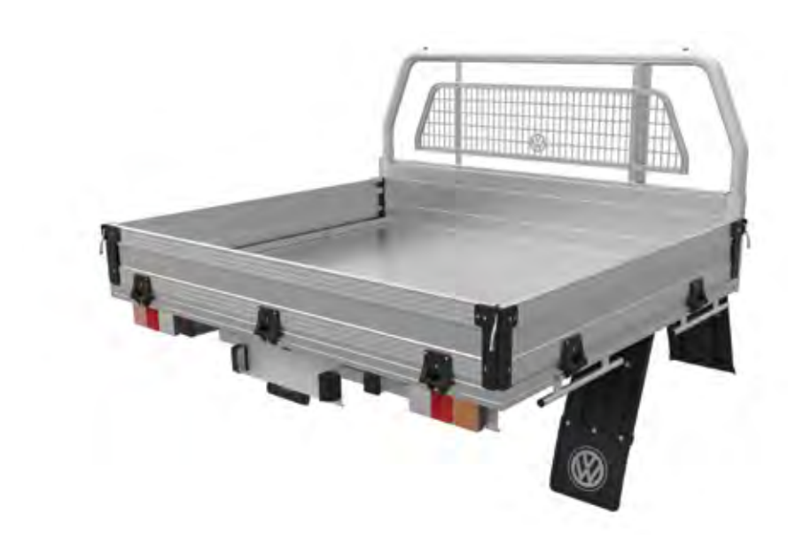
08 Amarok alloy tray range