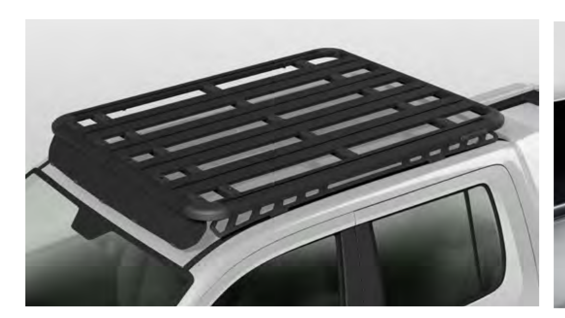
02 Amarok platform system

Part.no VGA071126AM17 (Flush mount, load rating 100Kg) Part.no VGA071126AM17C (Commercial, load rating 100Kg)