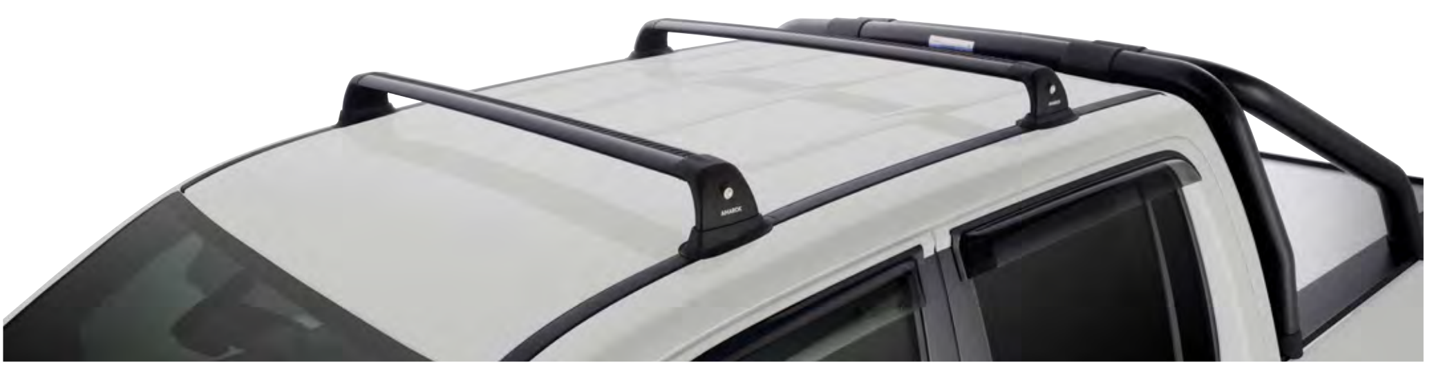
01 Roof bars

Part.no VGA071126AM17 (Flush mount, load rating 100Kg) Part.no VGA071126AM17C (Commercial, load rating 100Kg)