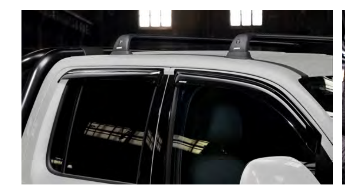
10 Slimline weathershields (tinted)

Part.no VGA2H00ED0800 (with torsion bar) Part.no VGA2H00ED0300 (without torsion bar)