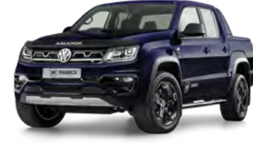
Atlantic Blue (MP)*