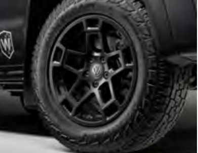
18" x 8.5" forged Alloy Wheels | W580X | With 265/60 R18 Pirelli Scorpion ATR Plus Tyres