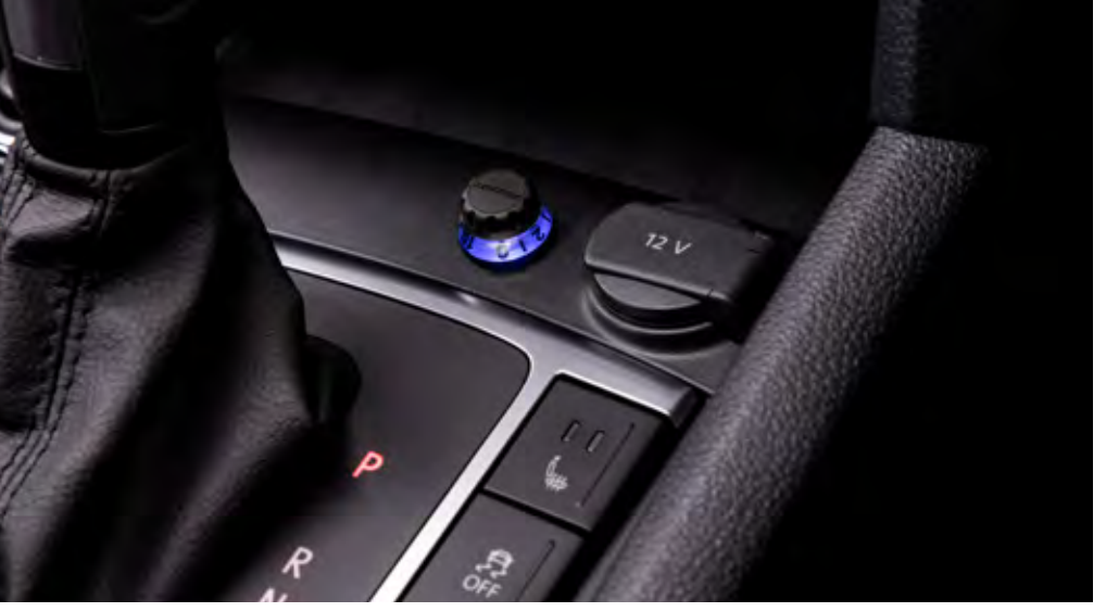
11 Amarok electronic trailer brake controller kit