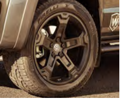
20" x 9" forged 'Clayton' Alloy Wheels | W580 | W580S | With 275/50 R20 Pirelli Scorpion ATR Tyres Steel spare wheel 255/60 R18 112T