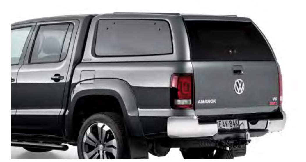
06 Premium canopy

Part.no 2H7071774GNP1 (W580 model) Part.no 2H7071774ENP1 (W580S model) Part.no VGACCVW80B02 (Roof racks to suit W580 roll cover) Part.no VWCCF090B02 (Roof racks to suit W580S roll cover)