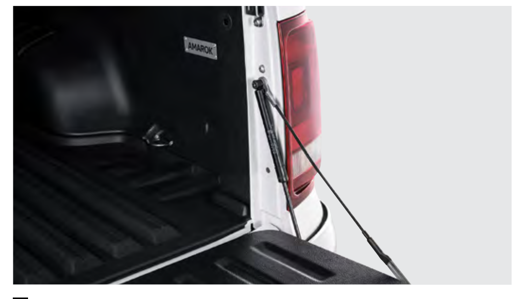
09 Amarok self-lowering tailgate system

Part.no VGA2H00ED0800 (with torsion bar) Part.no VGA2H00ED0300 (without torsion bar)