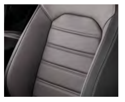
Vienna Leather# Trim Two-colour Vienna Leather# upholstery in Palladium Grey /Titanium Black