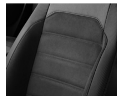
Art Velour Trim Two-colour microfleece seat upholstery in Palladium/Titanium Black