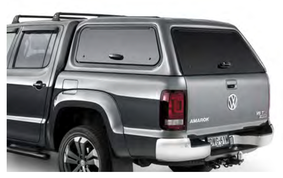
07 Standard canopy