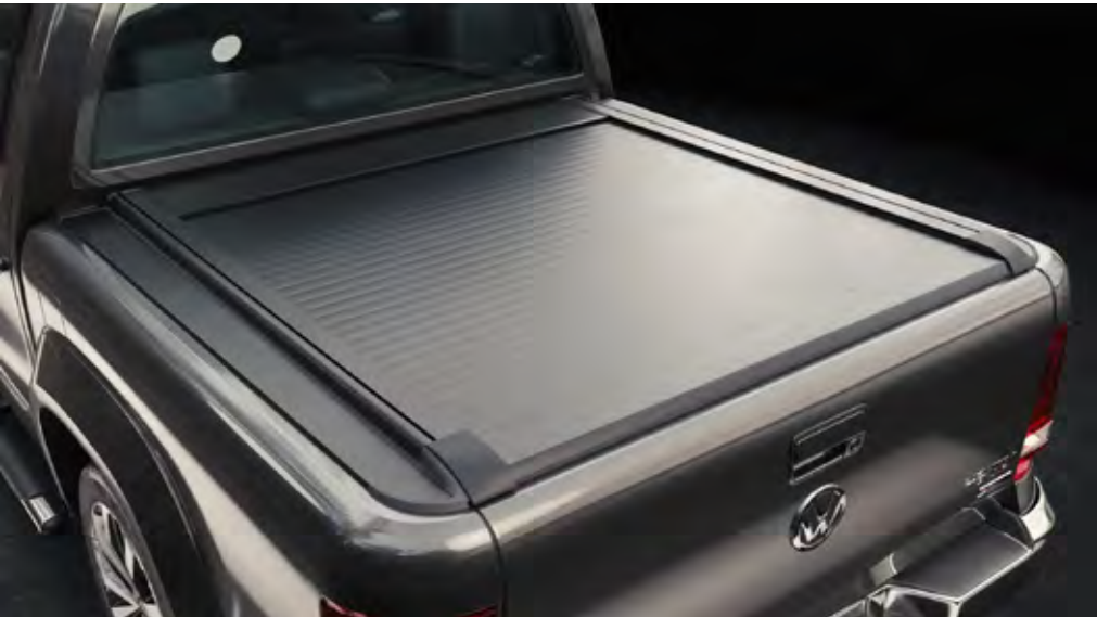
OS Amarok E-Cover (Electric) Only in conjunction with the W580S Model