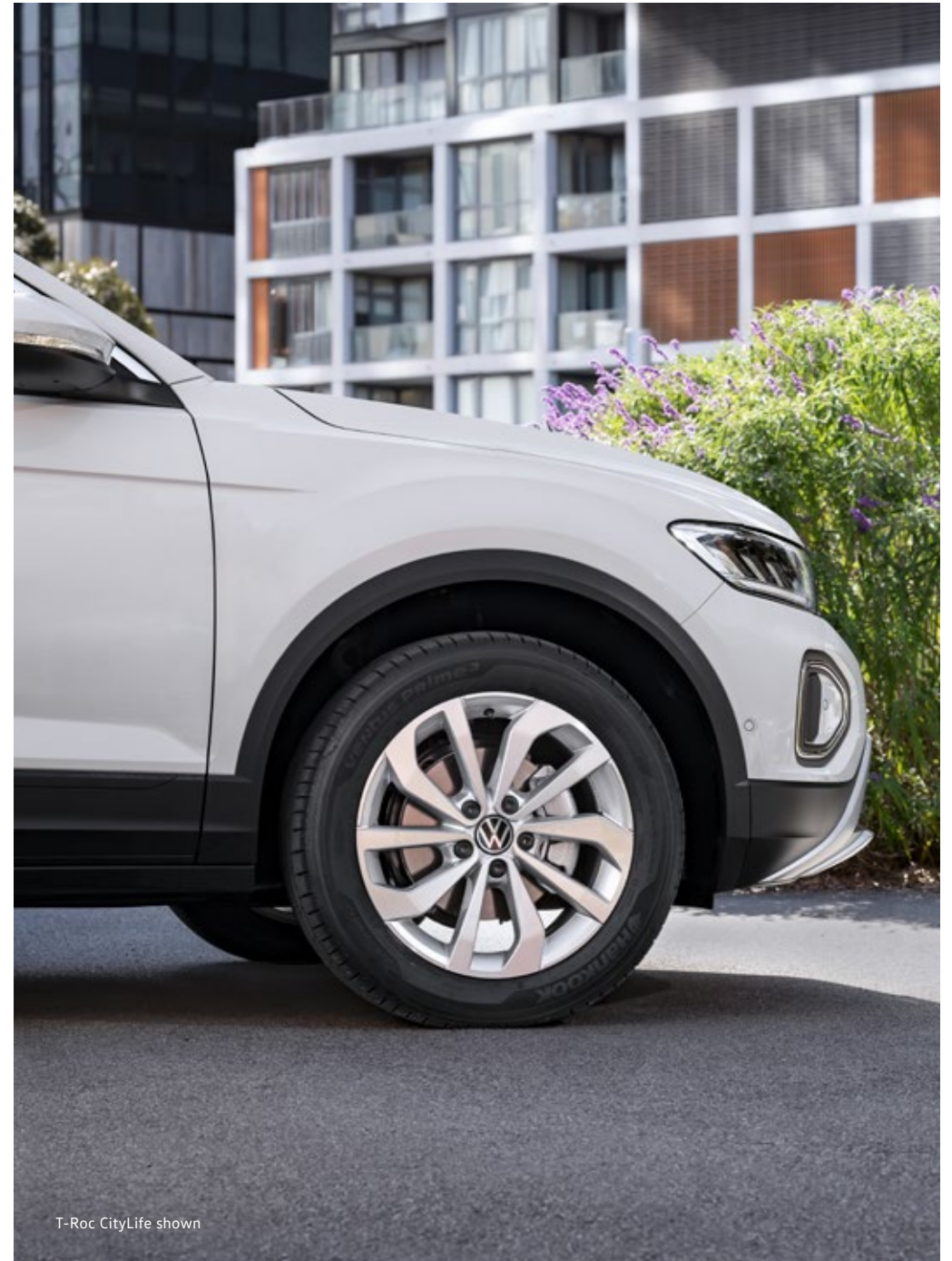
T-Roc CityLife shown