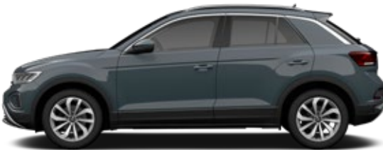
Petroleum Blue M