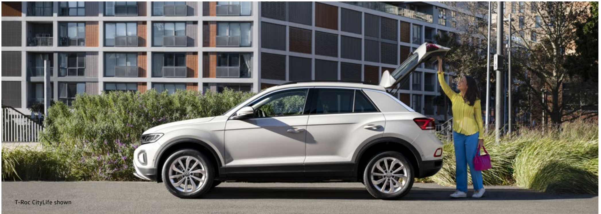
T-Roc CityLife shown