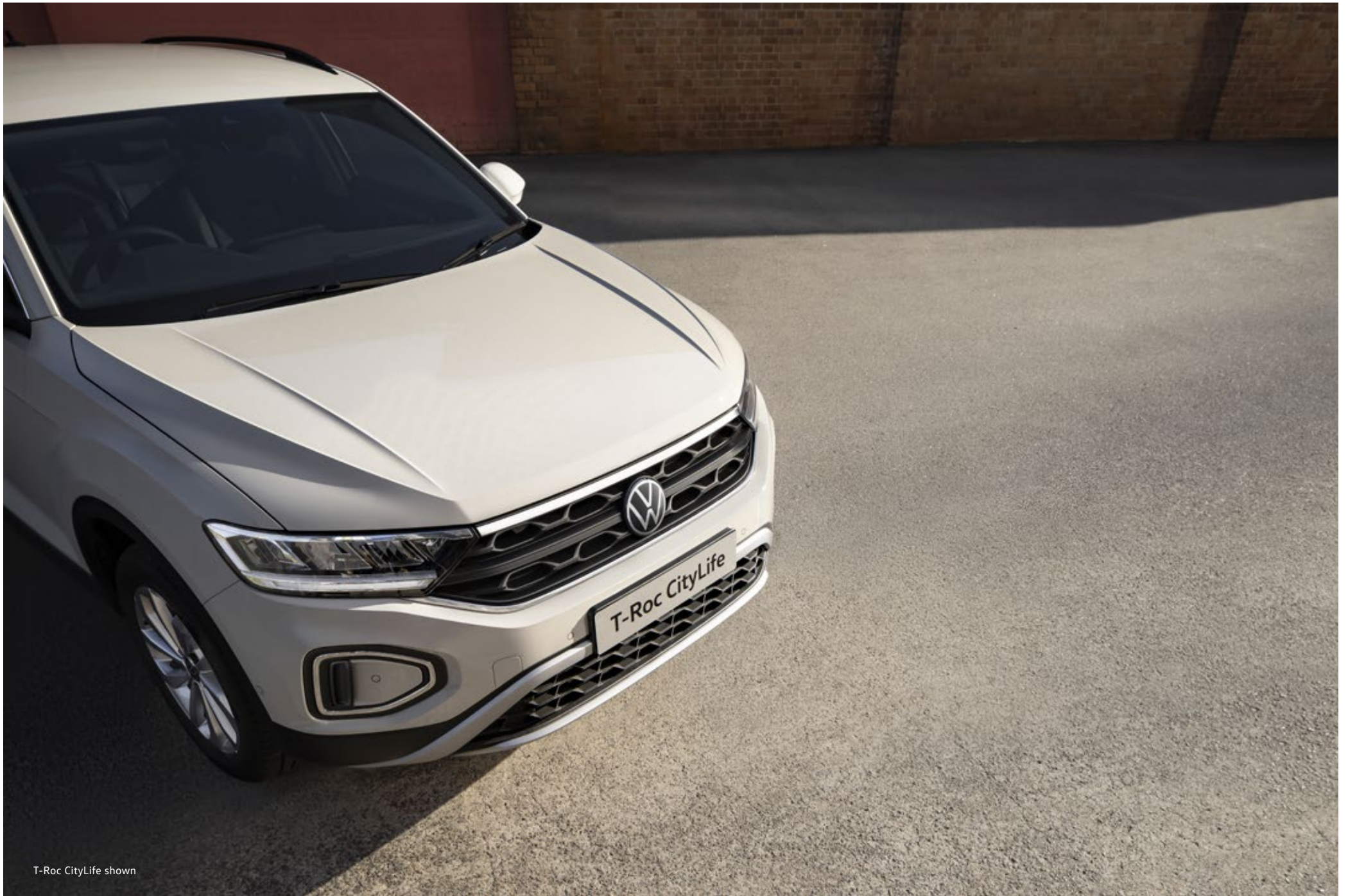
T-Roc CityLife shown