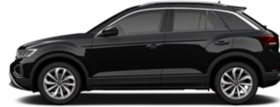
Deep Black PE