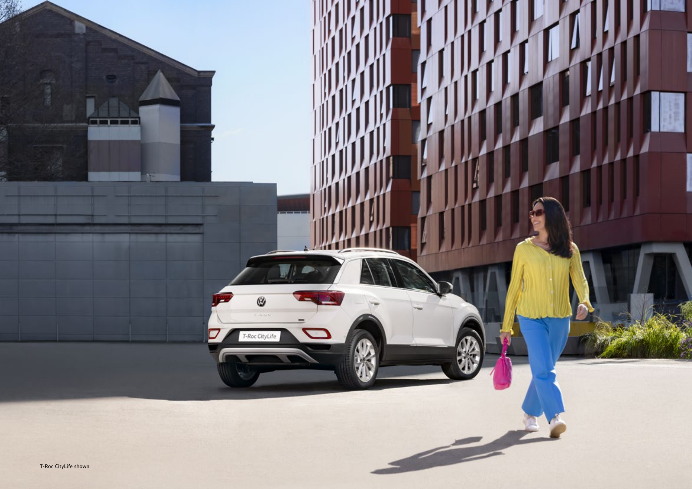
T-Roc CityLife shown