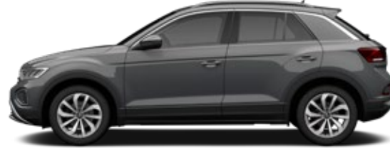
Indium Grey M