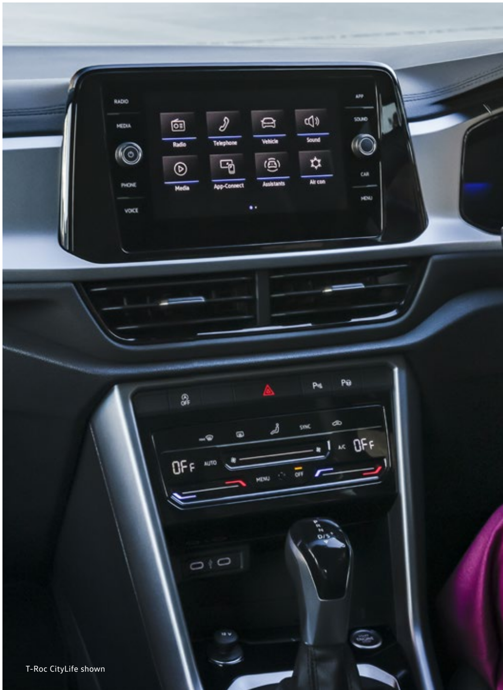
T-Roc CityLife shown