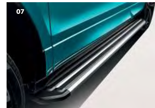
07 Side Steps Part.no 2GM071691