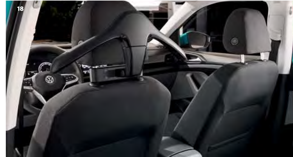
18 Coat Hanger

Meet your business needs. The Volkswagen coat hanger provides crease-free transport of your clothing with a removable function as well.