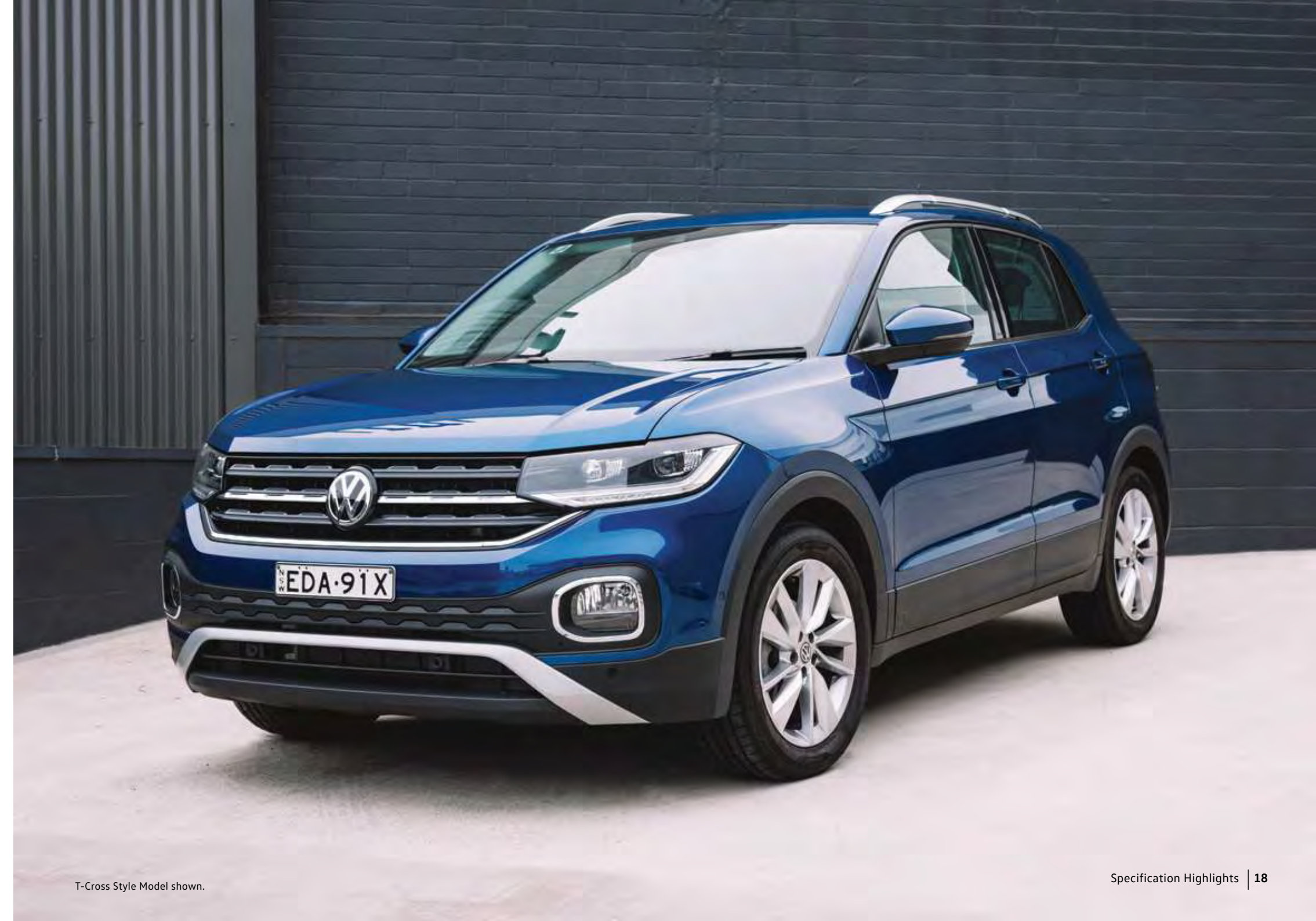
T-Cross Style Model shown.

-App-Connect is compatible for selected apps with the latest smartphone versions of iOS and Android, active data service, and connection cable (sold separately) MY23