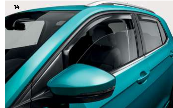
14 Slimline weathershields

Enjoy the circulating fresh air, even when it is raining or snowing, or avoid the unpleasant build-up of heat on hot days by opening the windows slightly.