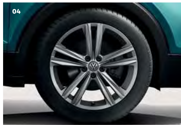
04 Sebring alloy wheel 17" Sebring wheel in grey metallic finish. Part.no 2GM071498FZZ