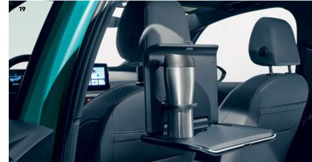
19 Folding table with cup holder

The Volkswagen folding table with built-in cup holder is especially useful on long journeys and offers the rear passengers a practical surface with height and angle adjustment.