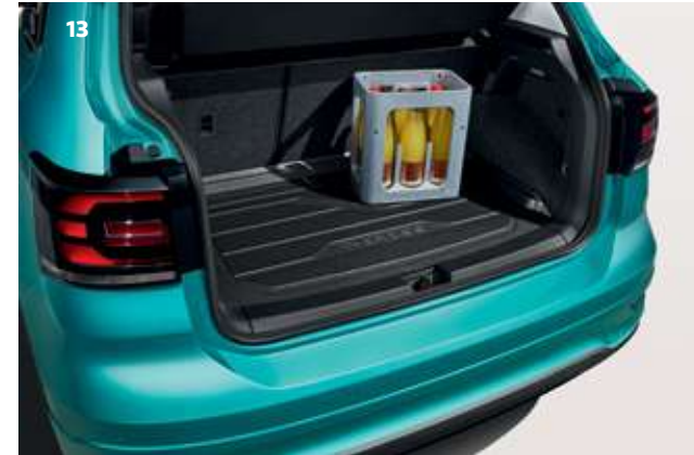
13 Luggage compartment tray

A perfect fit: Can be wiped clean and is acid-resistant, the robust and durable luggage compartment tray with T-CROSS lettering easily keeps your luggage compartment clean.