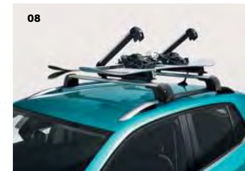
08 Ski and snowboard carrier When it comes to top of the mountain, there's nothing better on top. You can take up to six pairs of skis or up to four snowboards on the roof of your vehicle, comfortably and safely. The lockable ski and snowboard holder can quickly be mounted on the roof bars and is easy to operate.