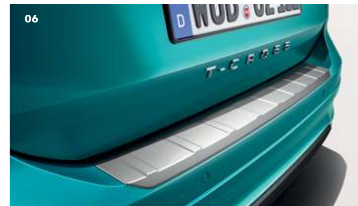
06 Loading sill protection plate The loading sill protection in stainless steel provides instant, stylish protection for an even more premium look to your vehicle. Part.no 2GM061195