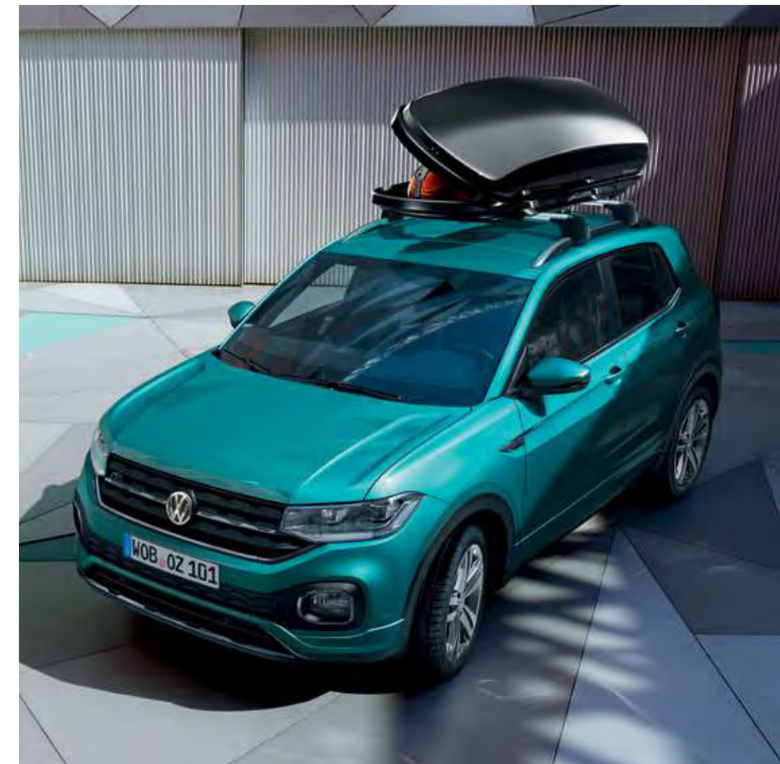
11 Premium Roof Box 340L & 460L The aerodynamic roof box provides an impressive combination of minimal driving noise together with simple and quick installation using a quick-action clamping mechanism. Further highlights: comfortable and easy opening from both sides thanks to the innovative "DuoLift system" and the pneumatic springs integrated at the front and rear as well as optimal anti-theft protection through a 3-point central locking system.

The premium roof box with its innovative aerodynamic design and quick and easy installation. Dual lift opening system with a 3-point central locking system. Available in 340 and 460 Litre capacities.