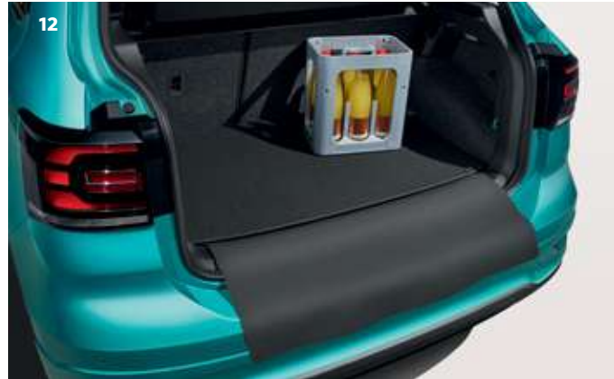
12 Reversible luggage compartment mat

The perfectly fitting, reversible luggage compartment mat helps out when you have sensitive, dirty or damp goods to take. You can choose from soft and gentle velour on one side or sturdy, anti-slip plastic nubs on the other. To make things even easier, a built-in protective cloth can be folded out from the reversible mat to help avoid scratches to the loading sill when you're loading and unloading.