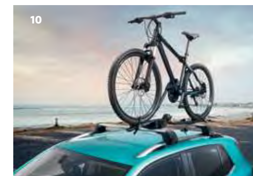
10 Bicycle carrier The aerodynamic bicycle holder has a quick-fastening system that makes it easy to fit and can be locked for piece of mind. Part.no 000071128F