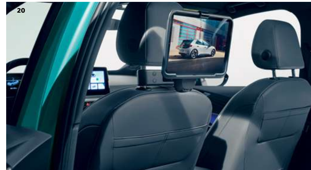
20 Tablet Holder

The Volkswagen innovative Travel & Comfort system has a basic module that is simply fixed between the front seat headrest mountings and can be used with various tablet holder attachments which brings comfort and convenience to any journey. Please contact your local Volkswagen dealer for compatible devices.