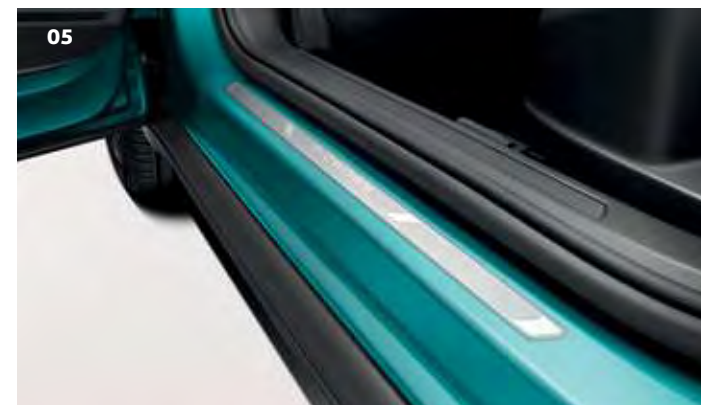
05 Door sill protection plate The high-quality aluminium door sill plates with T-Cross lettering not only protect the heavily used entrance area but adds a more premium look to your vehicle. For the front. Part.no 2GM071303