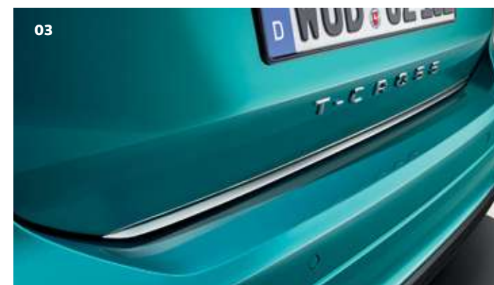
03 Tailgate protective strip The protection strip in high-gloss chrome protects the tailgate edges and adds to the appearance of the vehicle. Part.no 2GM071360