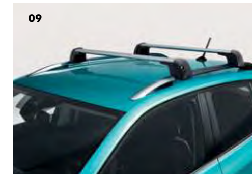
09 Roof Bars The genuine roof bars provide the base for all roof attachments and are aerodynamically designed to suit the T-CROSS. Load capacity: 70kg Part.no 2GA071151A