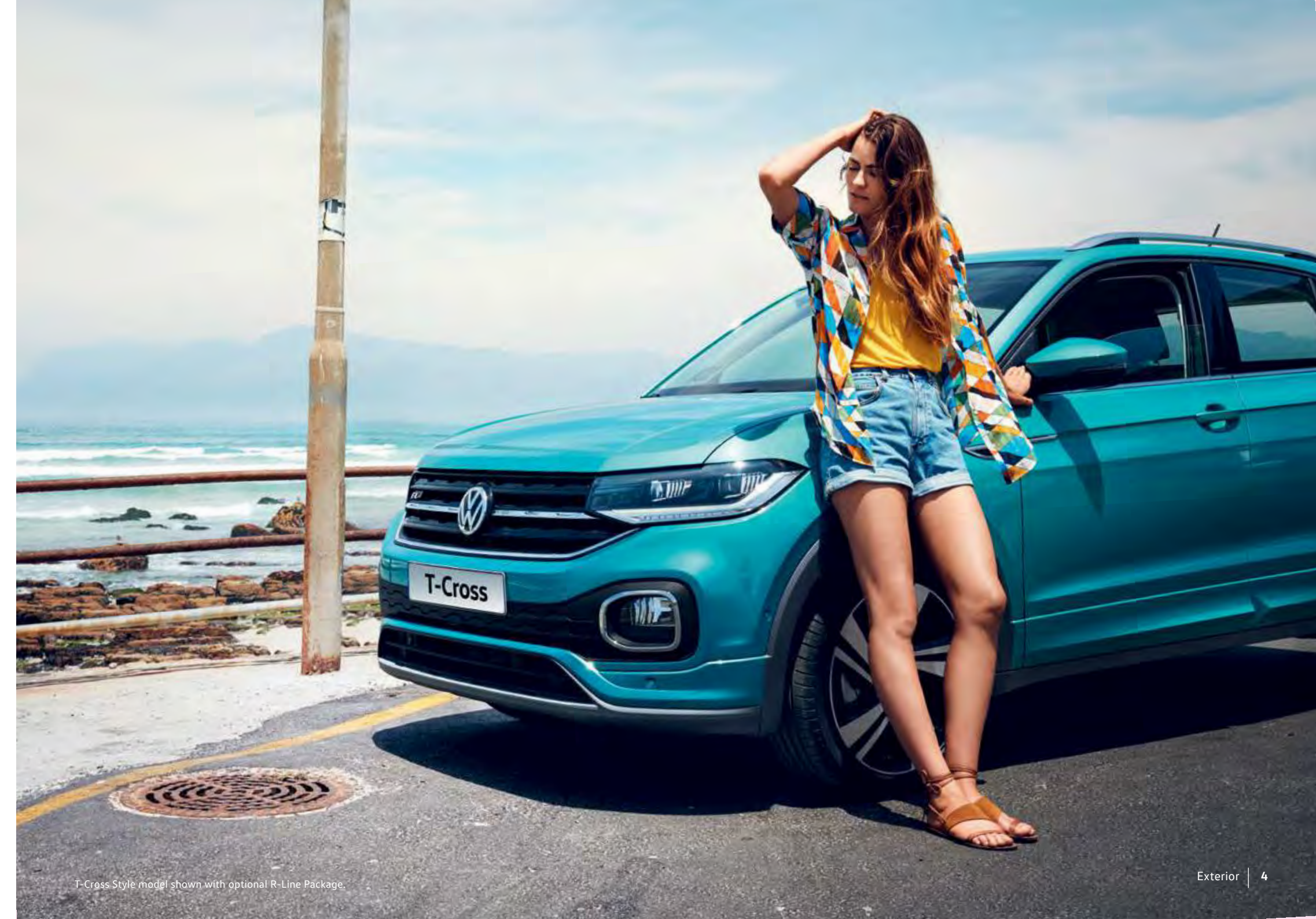
T-Cross Style model shown with optional R-Line Package.