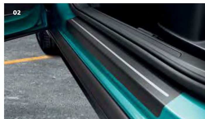
02 Door sill protection film A detail which is both sensible and functional to protect the heavily used door sills in the front and rear entrance areas against scratches and damage. Part.no 2GM071310