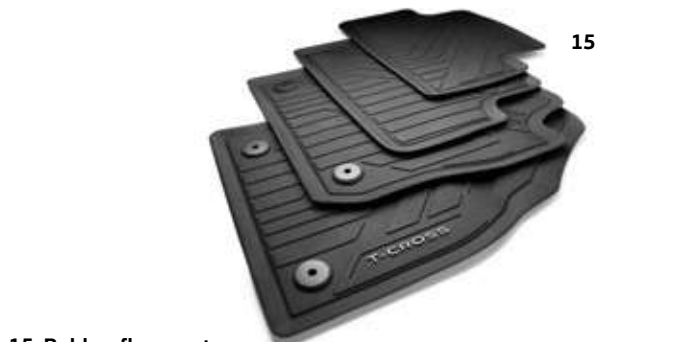
15 Rubber floor mats

Keeping the footwell clean all year round: The perfectly fitting and durable floor mat set with T-Cross lettering on the front mats are attached to the vehicle floor using the integrated fastening system to prevent slipping.