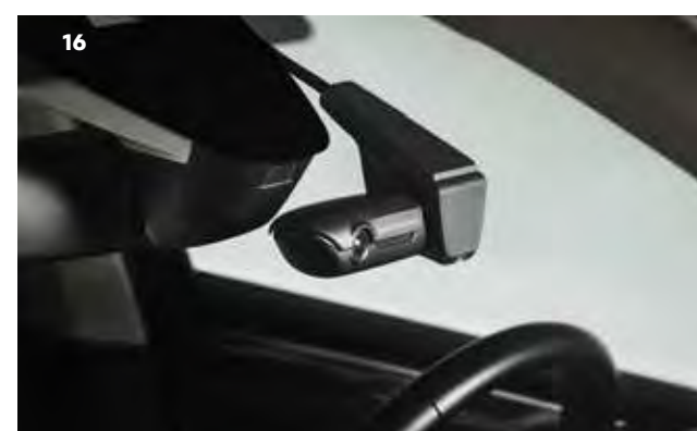
16 Universal Traffic Recorder