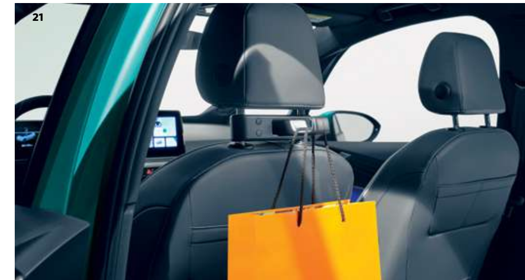
21 Bag Hook

*For tablet holders, please contact your local Volkswagen dealer for compatible devices.