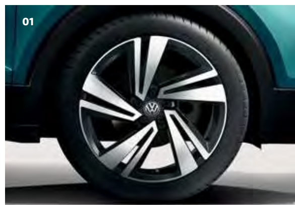
01 Nevada alloy wheel 18" Nevada wheel in gloss machined look. Part.no 2GM071497Z49