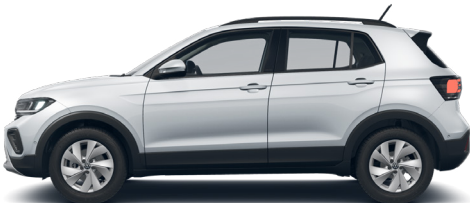
Reflex Silver M