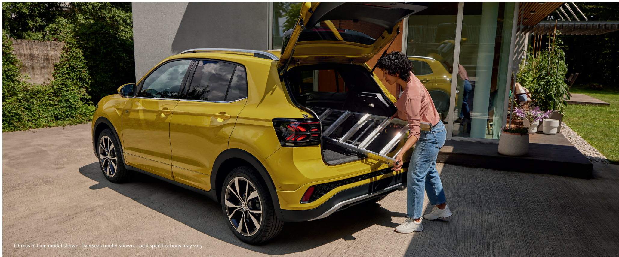
T-Cross R-Line model shown. Overseas model shown. Local specifications may vary.