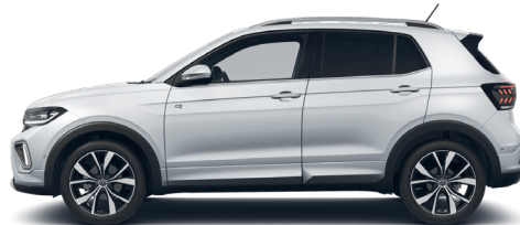
Reflex Silver M