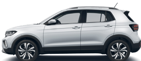
Reflex Silver M