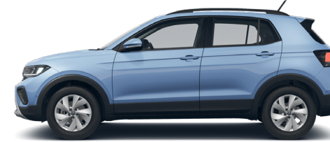
Clear Blue M