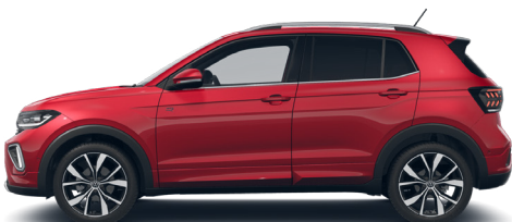
Kings Red PM