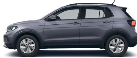
Smokey Grey M