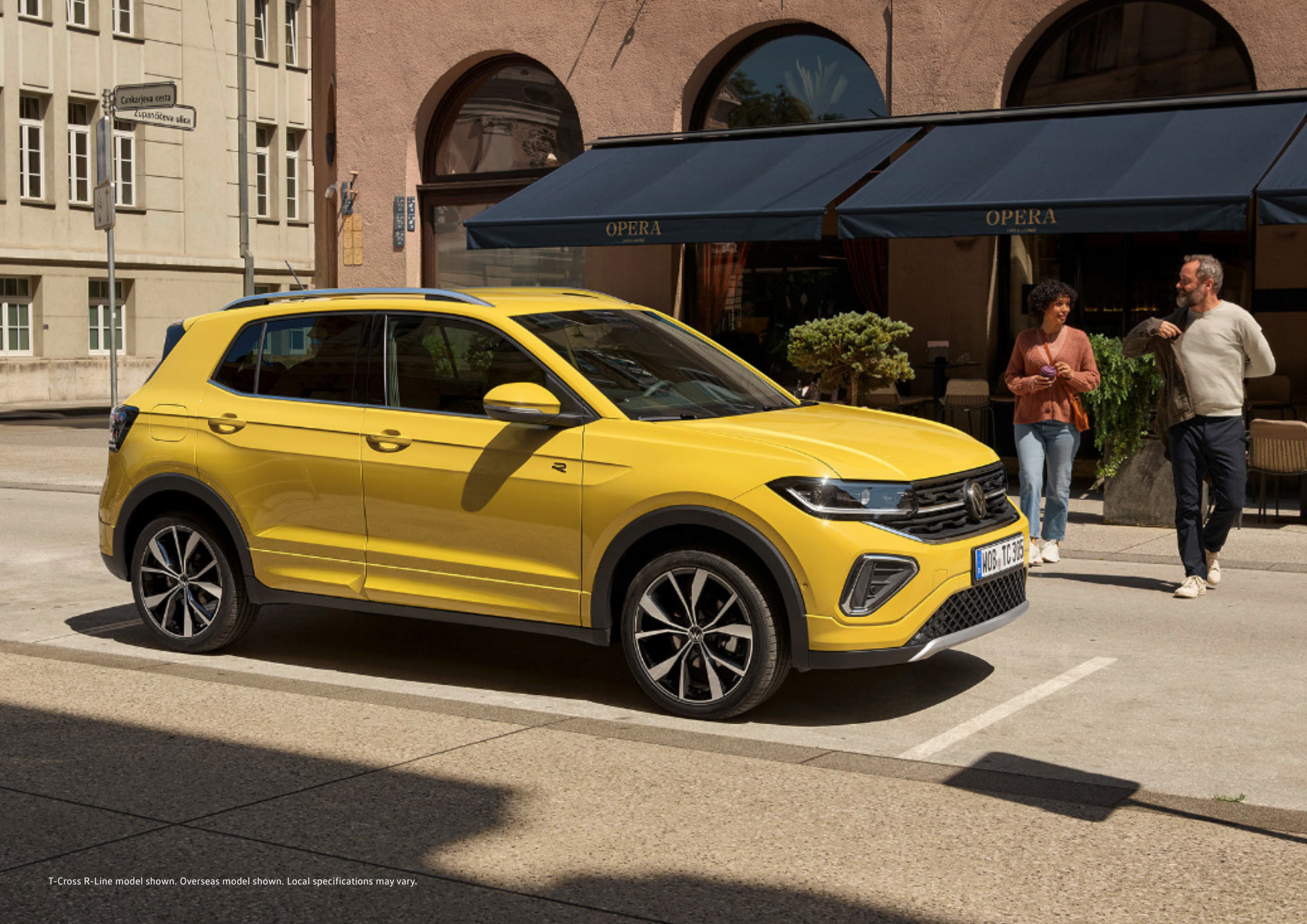
T-Cross R-Line model shown. Overseas model shown. Local specifications may vary.