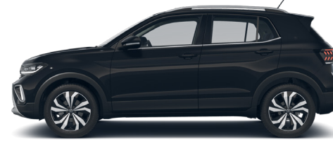
Deep Black PE