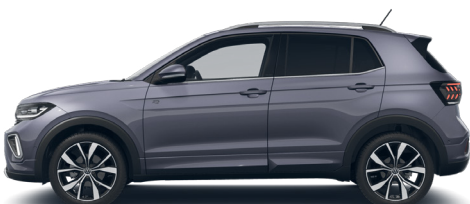
Smokey Grey M