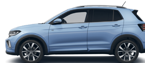
Clear Blue M