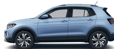
Clear Blue M