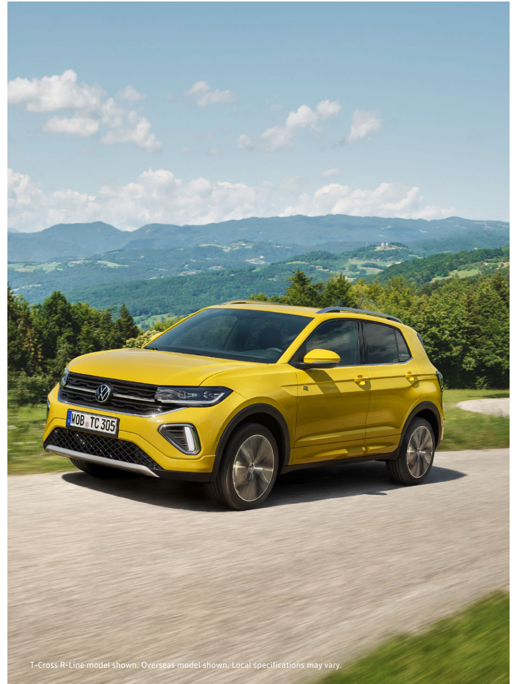
T-Cross R-Line model shown. Overseas model shown. Local specifications may vary.