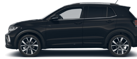
Deep Black PE