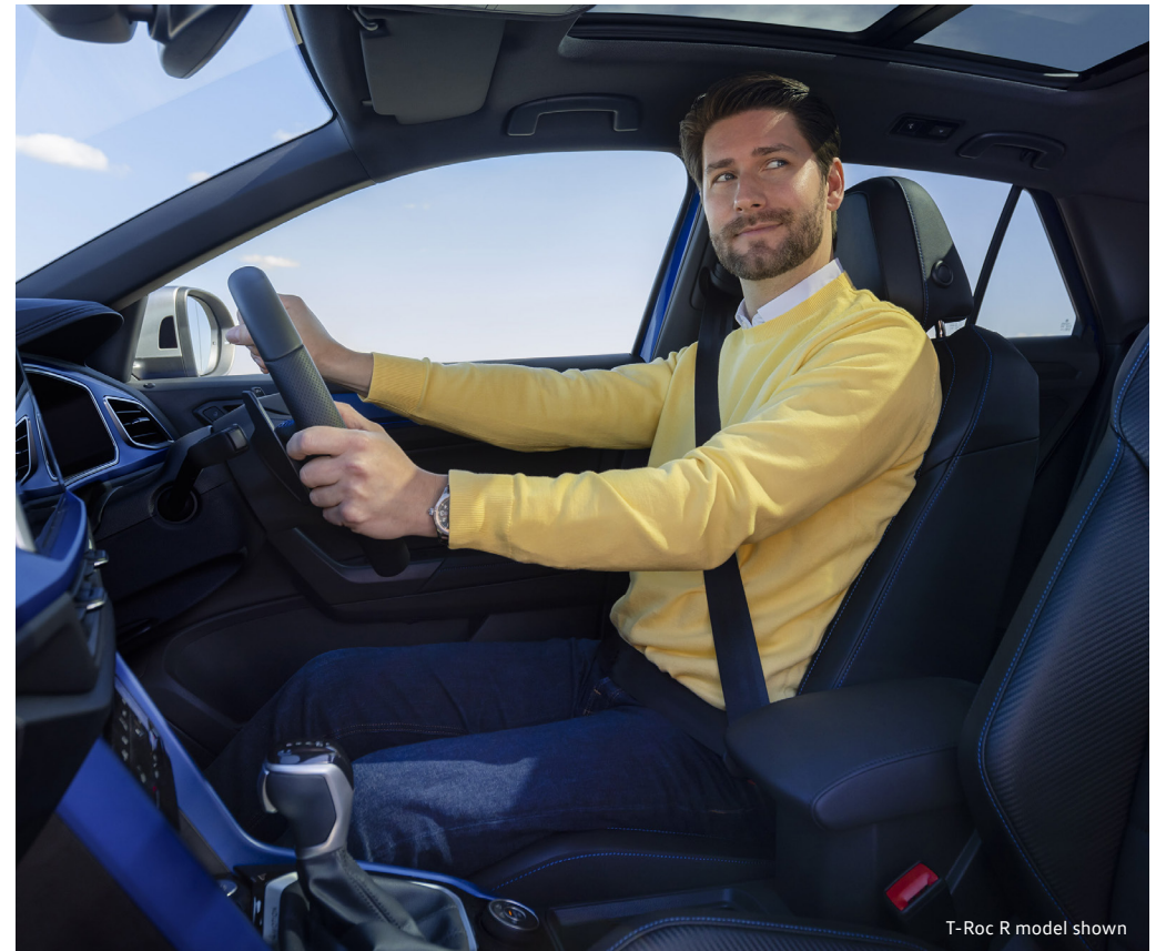
T-Roc R model shown