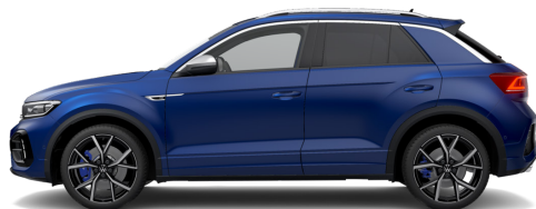
Lapiz Blue Premium Metallic