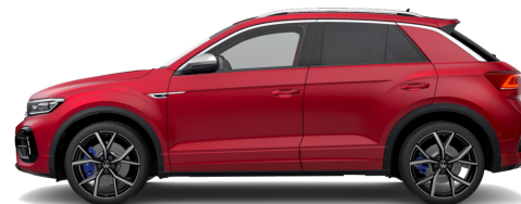
Kings Red Premium Metallic