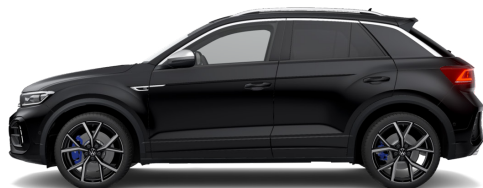
Deep Black Pearl Effect