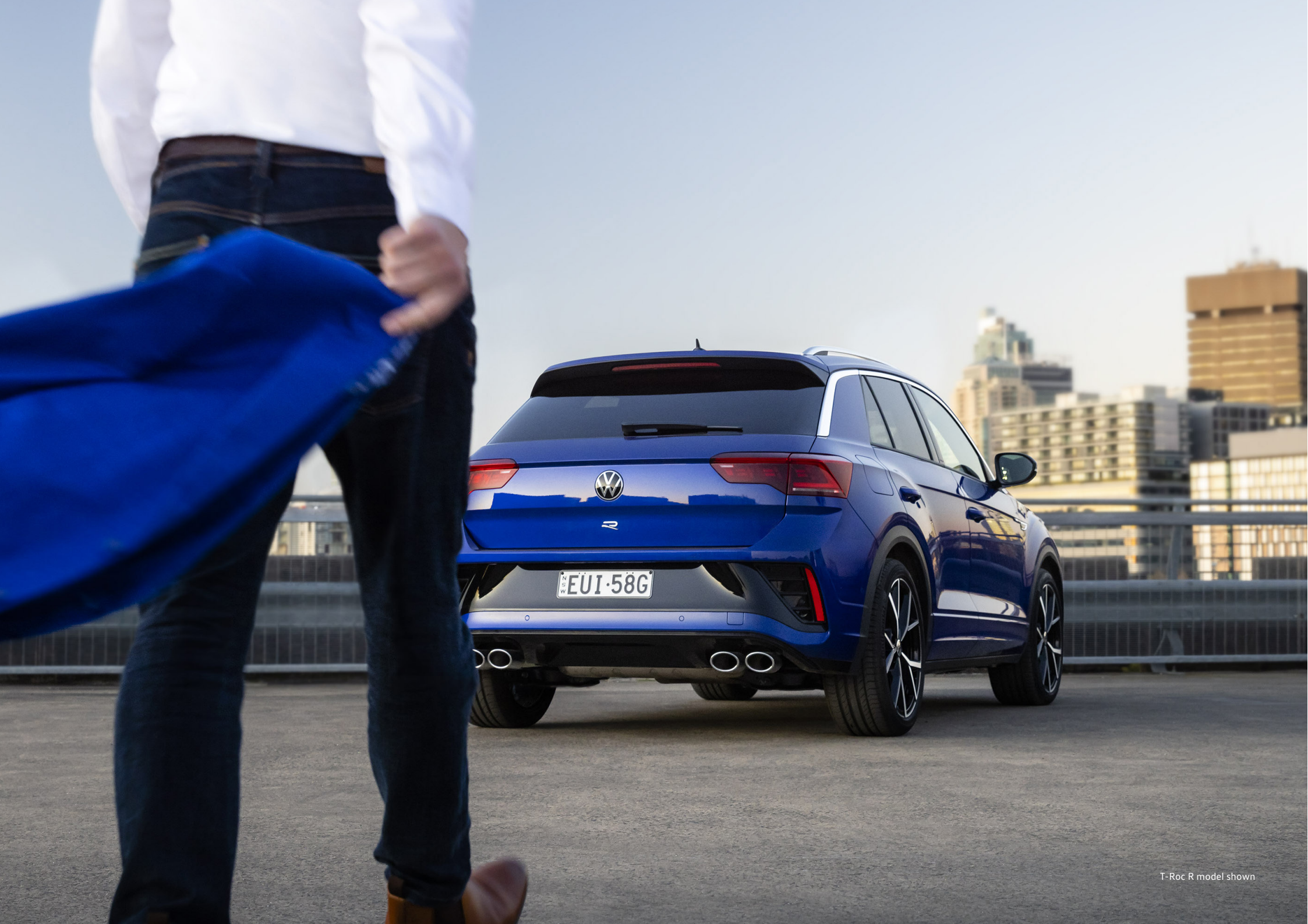
T-Roc R model shown