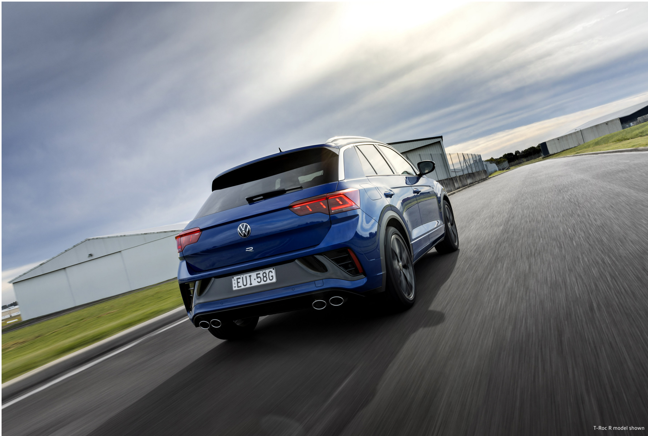
T-Roc R model shown