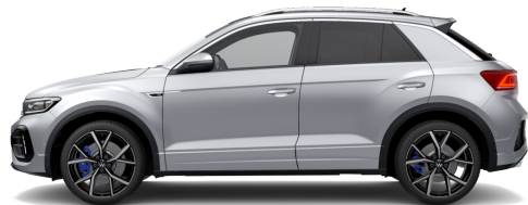
Pyrite Silver Metallic