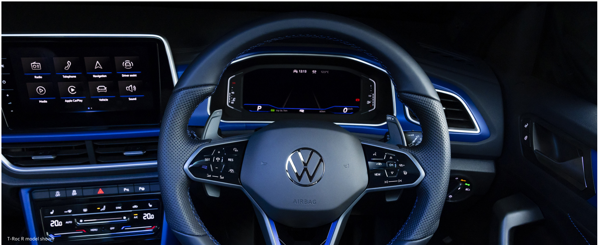
T-Roc R model shown