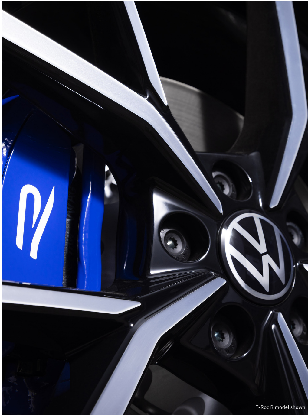
T-Roc R model shown