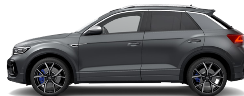
Indium Grey Metallic