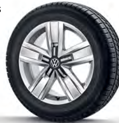
17" alloy wheel - DEVONPORT