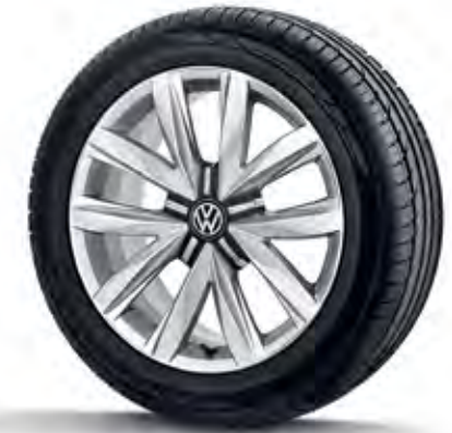
18" alloy wheel - SPRINGFIELD

Standard on Comfortline Exec and Highline models