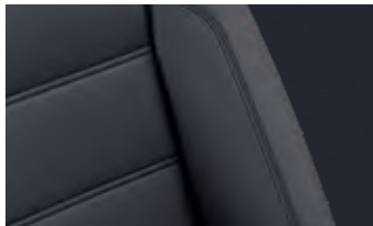
Nappa Leather* in Titanium Black Standard on Highline Optional on Comfortline Premium and Exec