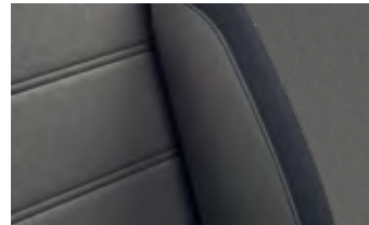
ArtVelours Microfleece in Palladium/Titanium Black Standard on Comfortline Exec Optional on Comfortline Premium