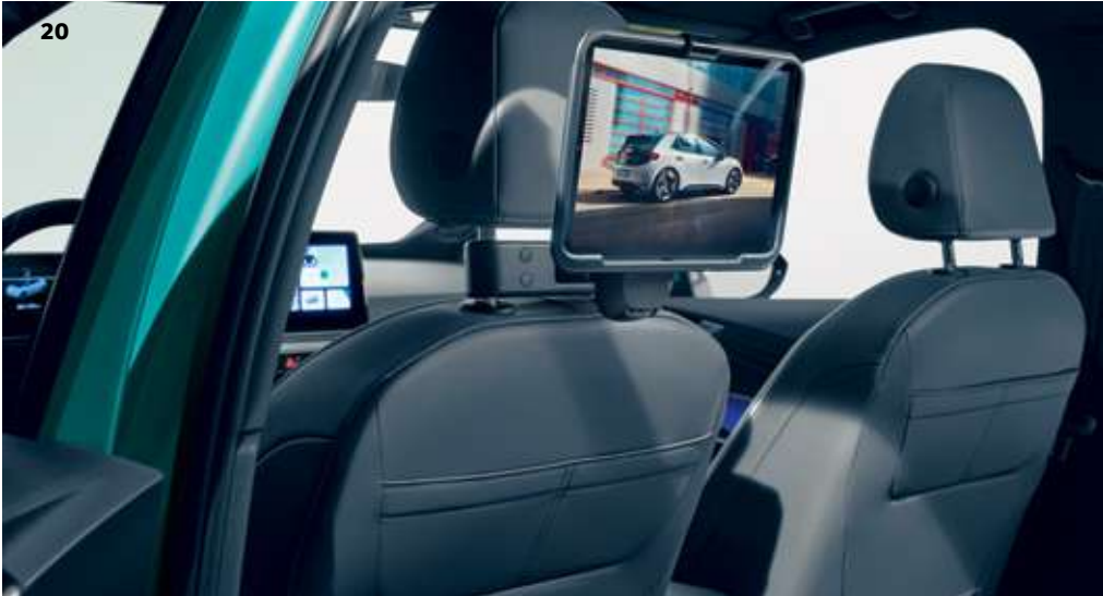
20 Tablet Holder The Volkswagen innovative Travel & Comfort system has a basic module that is simply fixed between the front seat headrest mountings and can be used with various tablet holder attachments which brings comfort and convenience to any journey. Please contact your local Volkswagen dealer for compatible devices.

*For tablet holders, please contact your local Volkswagen dealer for compatible devices.