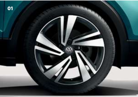
01 Nevada alloy wheel 18" Nevada wheel in gloss machined look. Part.no 2GM071497Z49