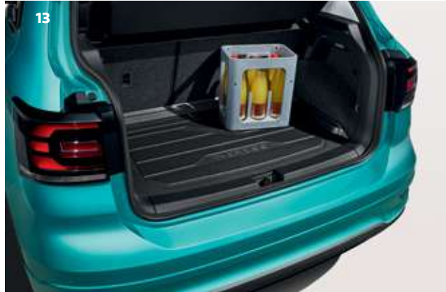
13 Luggage compartment tray A perfect fit: Can be wiped clean and is acid-resistant, the robust and durable luggage compartment tray with T-CROSS lettering easily keeps your luggage compartment clean.