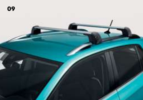
09 Roof Bars The genuine roof bars provide the base for all roof attachments and are aerodynamically designed to suit the T-CROSS. Load capacity: 70kg Part.no 2GA071151A