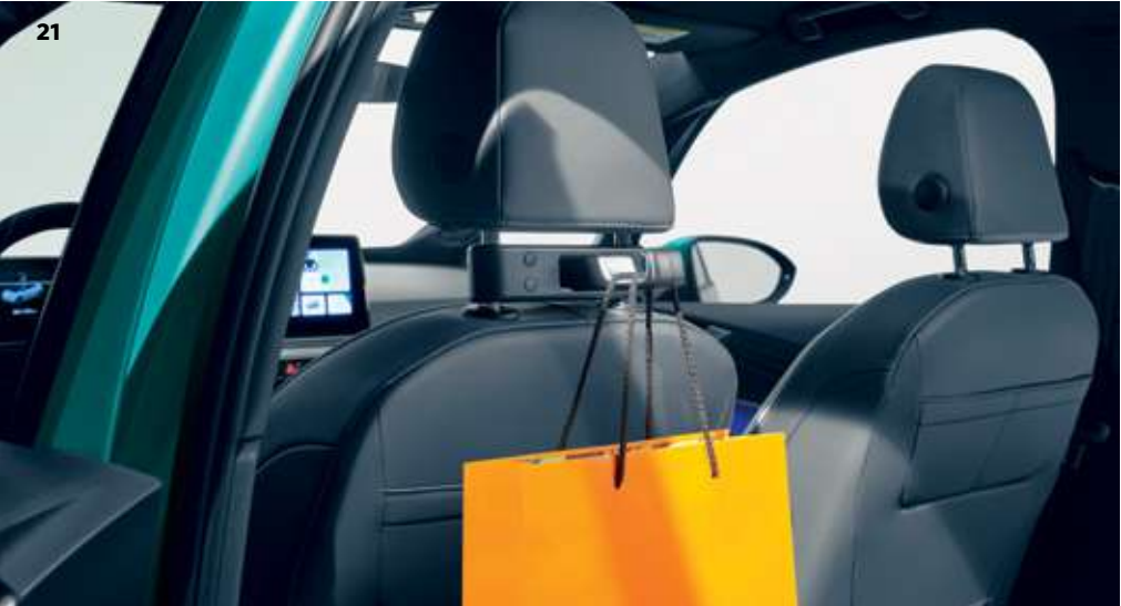
21 Bag Hook Part.no 000061126B

*For tablet holders, please contact your local Volkswagen dealer for compatible devices.