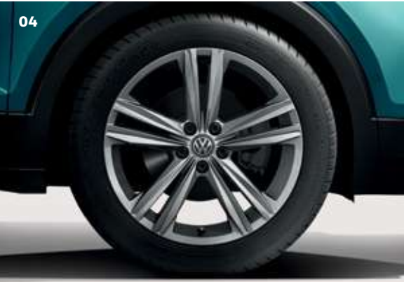
04 Sebring alloy wheel 17" Sebring wheel in grey mettalic finish. Part.no 2GM071498FZZ