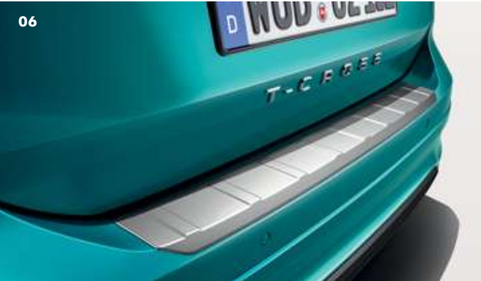
06 Loading sill protection plate The loading sill protection in stainless steel provides instant, stylish protection for an even more premium look to your vehicle. Part.no 2GM061195