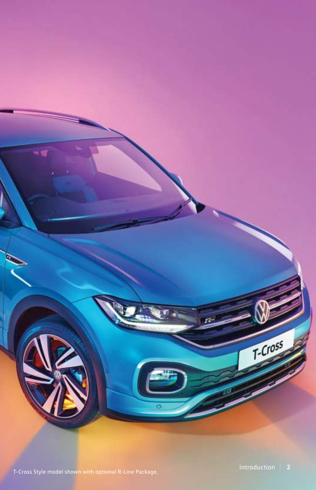
T-Cross Style model shown with optional R-Line Package.

Good things come in small packages. And the T-Cross offers plenty of proof.