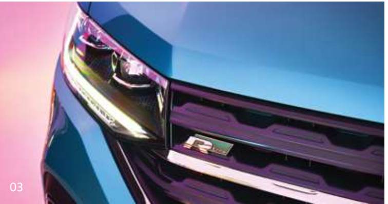
01 Optional Sound & Vision package shown 02 Optional 18" Nevada alloy wheels 03 Optional R-Line package shown