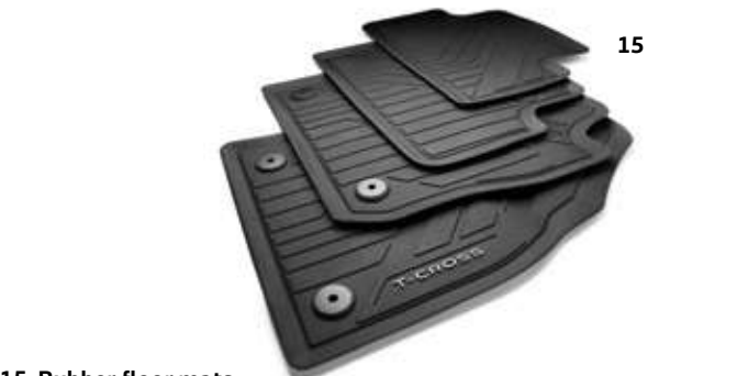
15 Rubber floor mats Keeping the footwell clean all year round: The perfectly fitting and durable floor mat set with T-Cross lettering on the front mats are attached to the vehicle floor using the integrated fastening system to prevent slipping. Front: Part.no 2GN06150282V Rear: Part.no 2GM06151282V