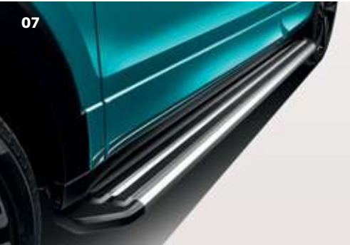
07 Side Steps Part.no 2GM071691