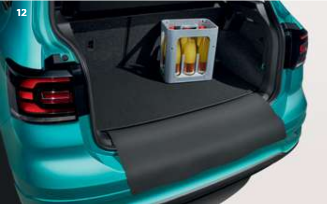
12 Reversible luggage compartment mat The perfectly fitting, reversible luggage compartment mat helps out when you have sensitive, dirty or damp goods to take. You can choose from soft and gentle velour on one side or sturdy, anti-slip plastic nubs on the other. To make things even easier, a built-in protective cloth can be folded out from the reversible mat to help avoid scratches to the loading sill when you're loading and unloading.