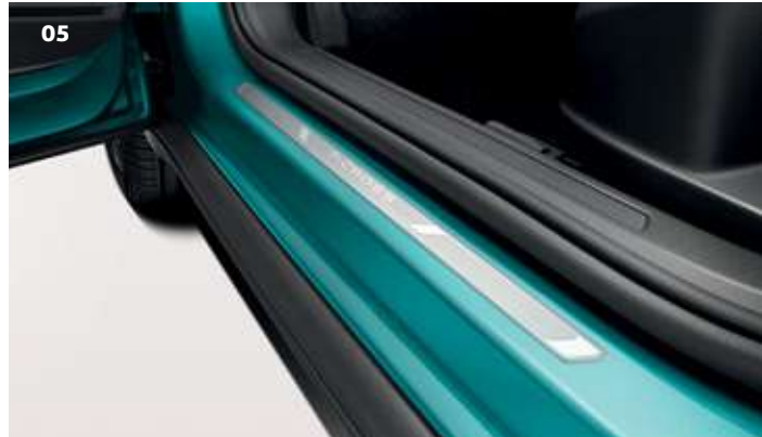
05 Door sill protection plate The high-quality aluminium door sill plates with T-Cross lettering not only protect the heavily used entrance area but adds a more premium look to your vehicle. For the front. Part.no 2GM071303