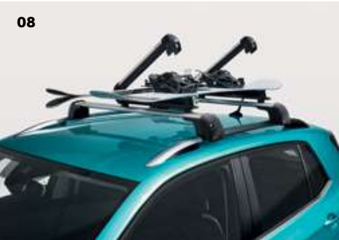
08 Ski and snowboard carrier When it comes to top of the mountain, there's nothing better on top. You can take up to six pairs of skis or up to four snowboards on the roof of your vehicle, comfortably and safely. The lockable ski and snowboard holder can quickly be mounted on the roof bars and is easy to operate.