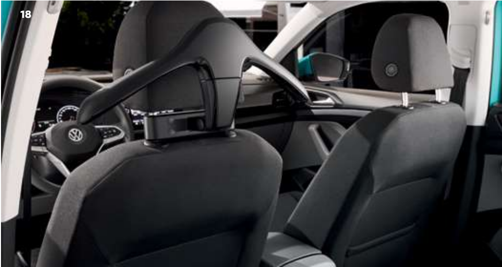
18 Coat Hanger Meet your business needs. The Volkswagen coat hanger provides crease-free transport of your clothing with a removable function as well.