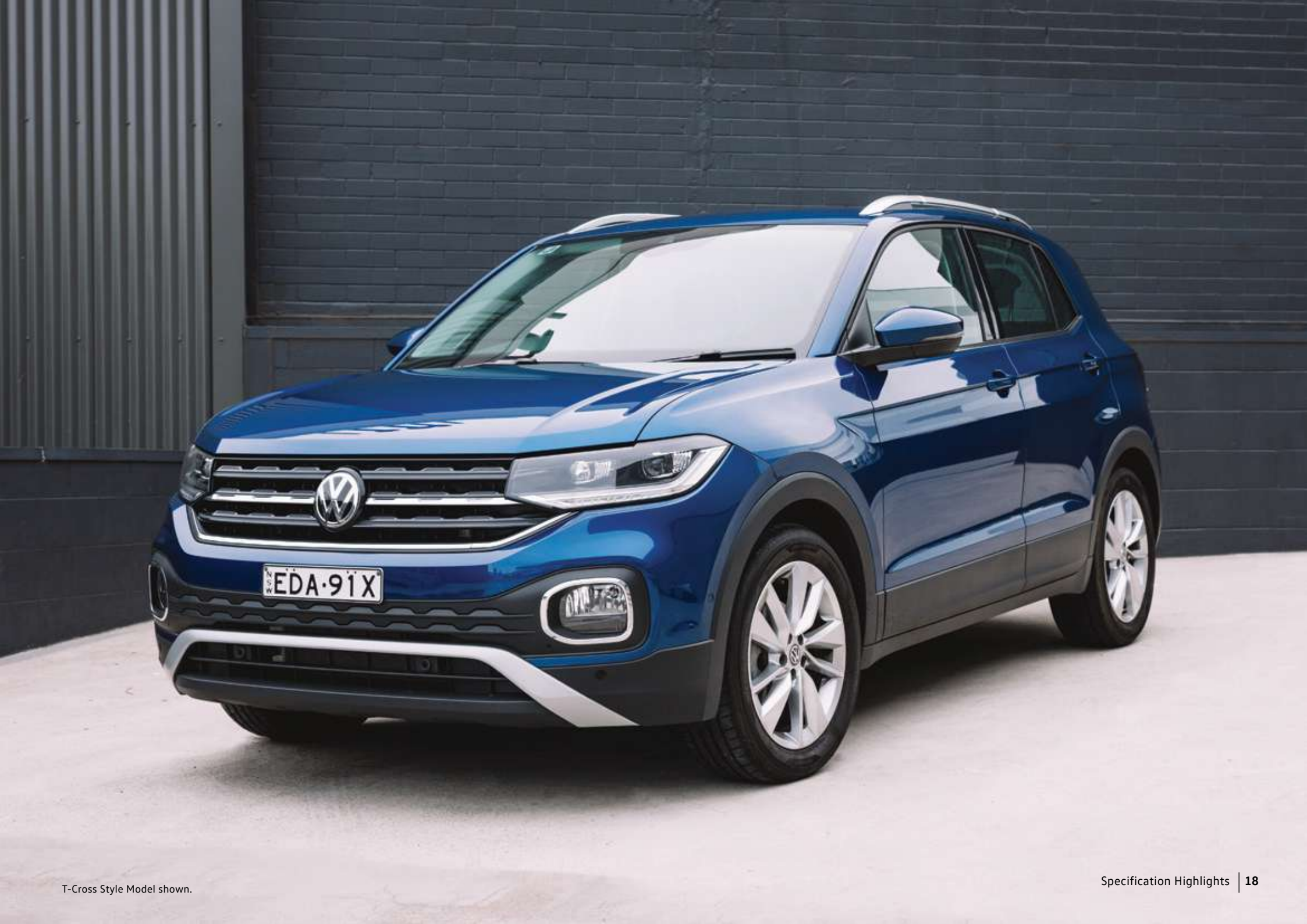
T-Cross Style Model shown.