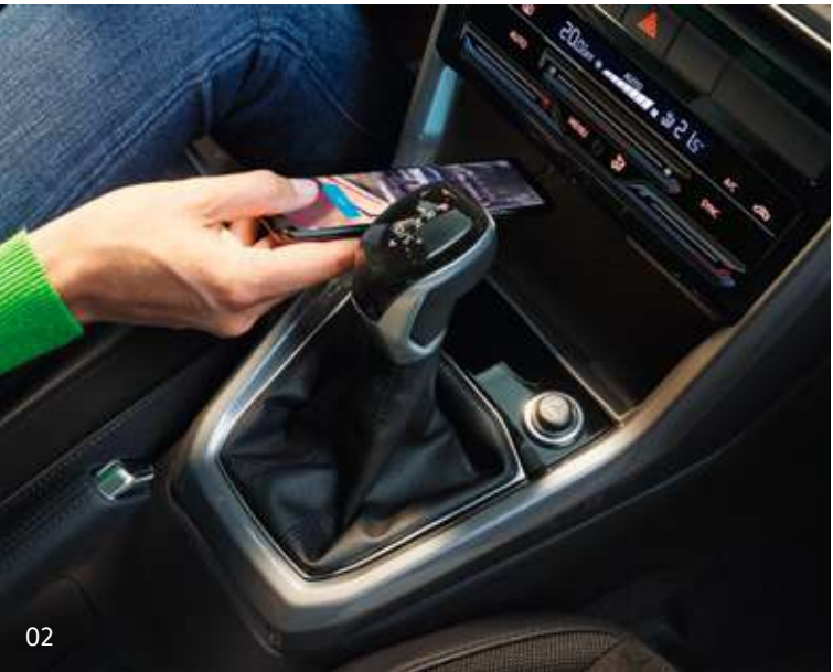
01 App-Connect~ featuring Apple CarPlay® 02 Centre console with wireless charging