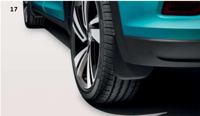
17 Mudflaps Front: Part.no 2GM075101 Rear: Part.no 2GM075111