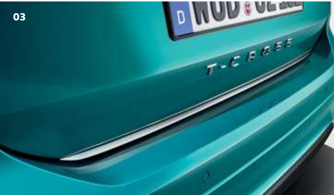
03 Tailgate protective strip The protection strip in high-gloss chrome protects the tailgate edges and adds to the appearance of the vehicle. Part.no 2GM071360