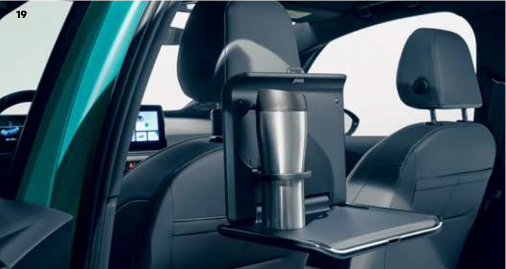
19 Folding table with cup holder The Volkswagen folding table with built-in cup holder is especially useful on long journeys and offers the rear passengers a practical surface with height and angle adjustment.