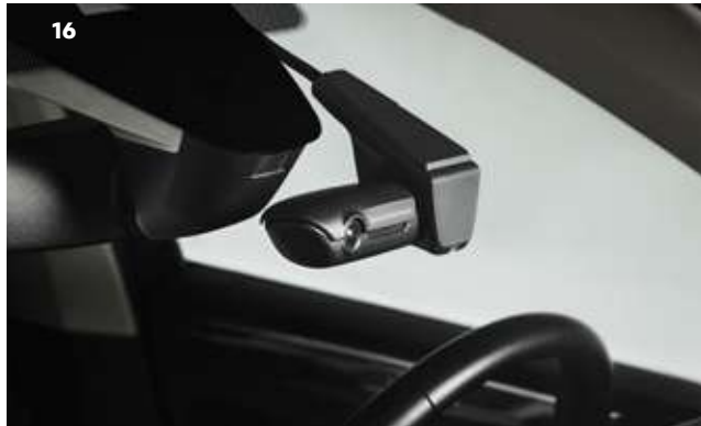
16 Universal Traffic Recorder Front: 000063511D Front & Rear: 000063511E