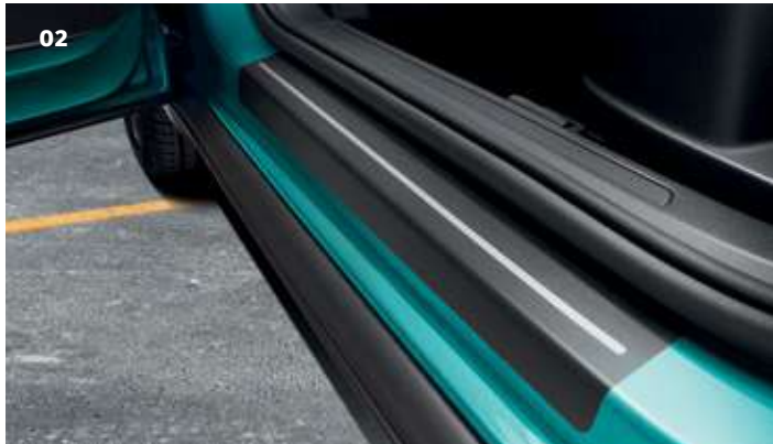
02 Door sill protection film A detail which is both sensible and functional to protect the heavily used door sills in the front and rear entrance areas against scratches and damage. Part.no 2GM071310