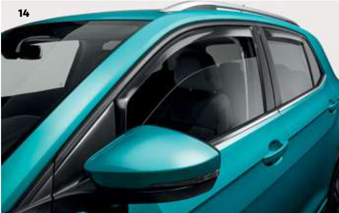
14 Slimline weathershields Enjoy the circulating fresh air, even when it is raining or snowing, or avoid the unpleasant build-up of heat on hot days by opening the windows slightly. Front: Part.no 2GM072193 Rear: Part.no 2GM072194