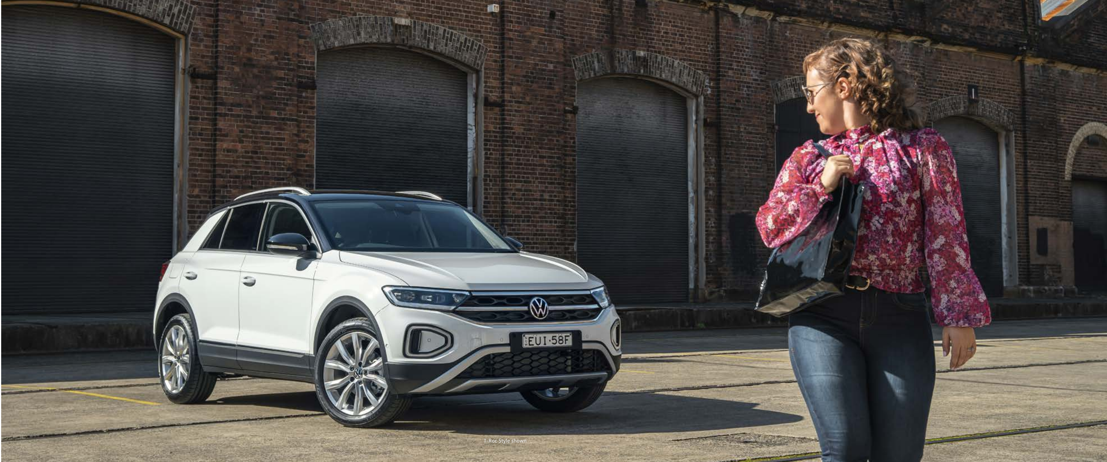
T-Roc Style shown