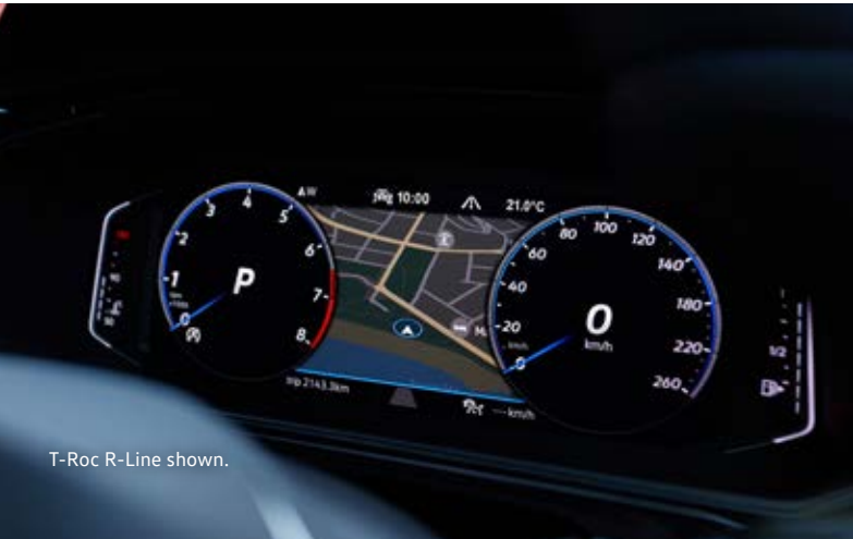
T-Roc R-Line shown.

*Safety technologies are designed to assist the driver, but should not be used as a substitute for safe driving practices.