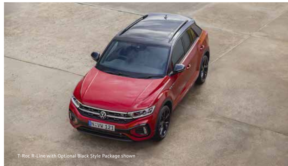
T-Roc R-Line with Optional Black Style Package shown