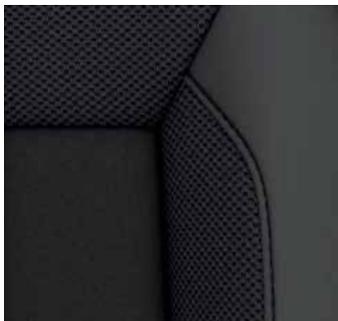
Style Black-Anthracite microfleece seat upholstery