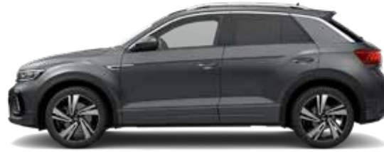
Indium Grey M