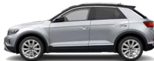
Pyrite Silver M