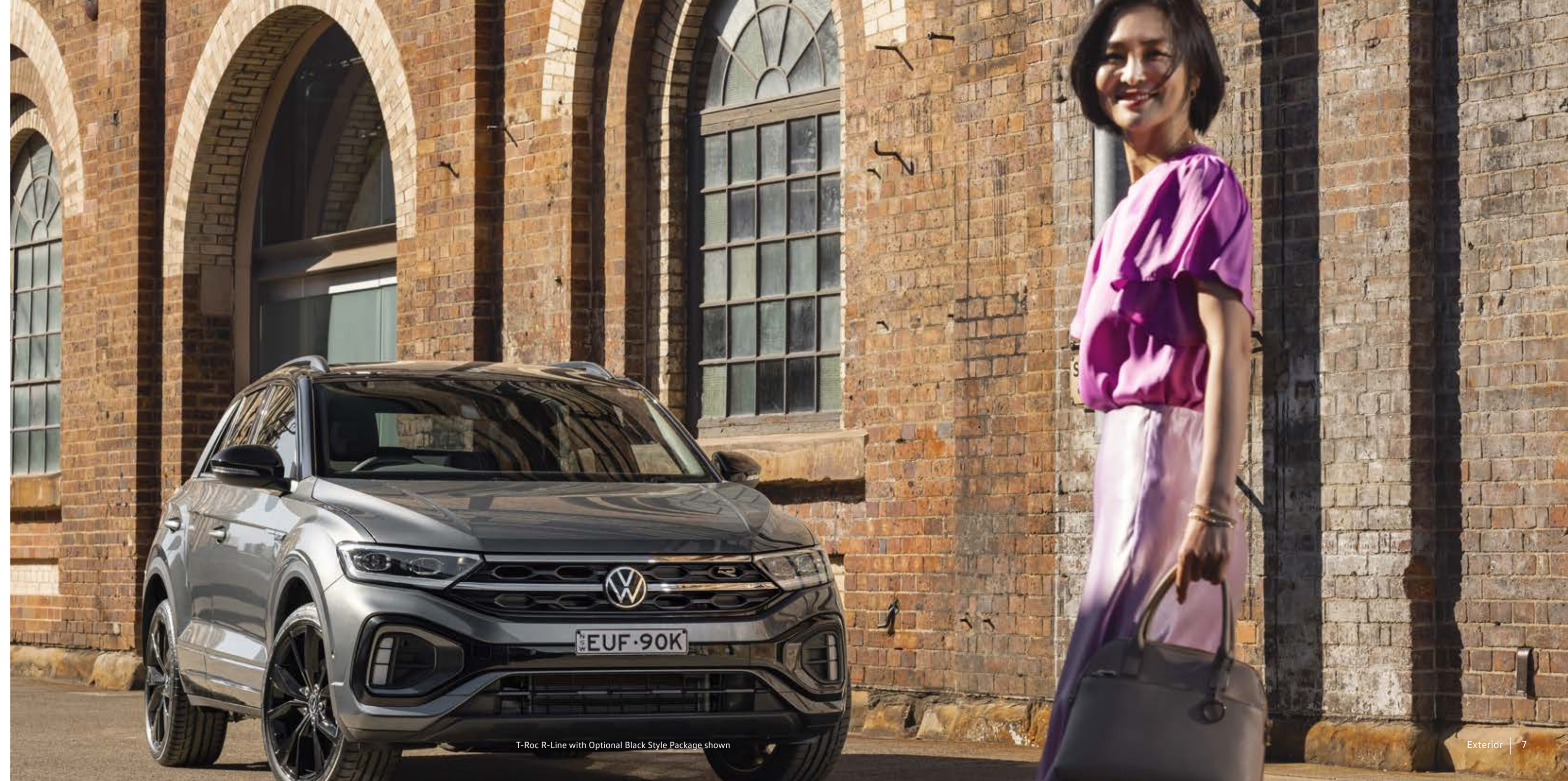
T-Roc R-Line with Optional Black Style Package shown

There's no mistaking the T-Roc's sharp styling and arresting design features when you see one on the road.