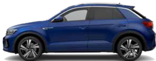
Lapiz Blue PM