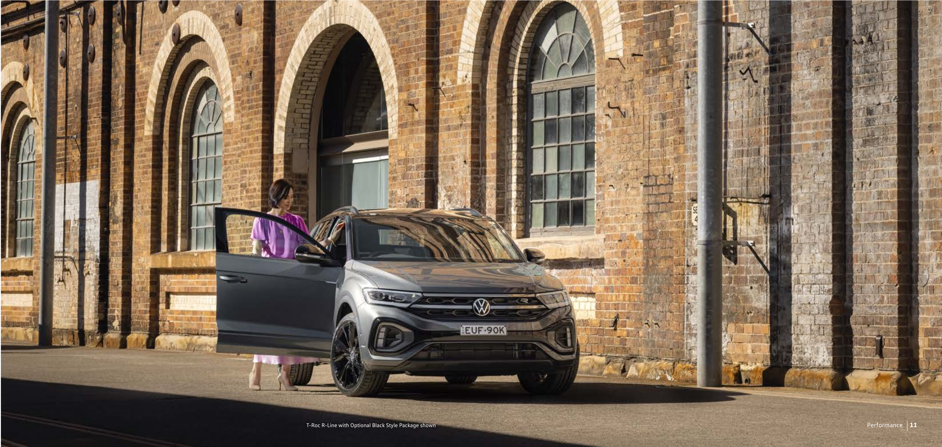
T-Roc R-Line with Optional Black Style Package shown