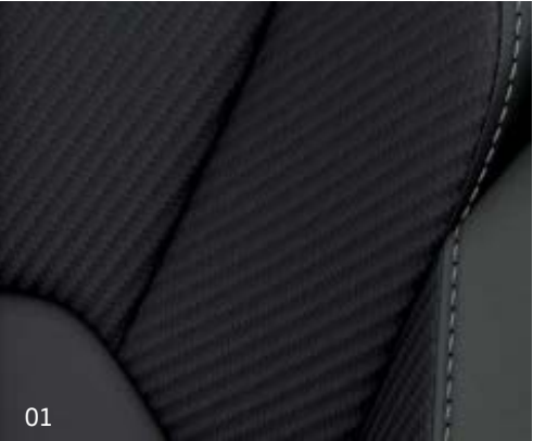
01 Black Nappa leather appointed seat upholstery