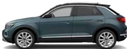
Petroleum Blue M