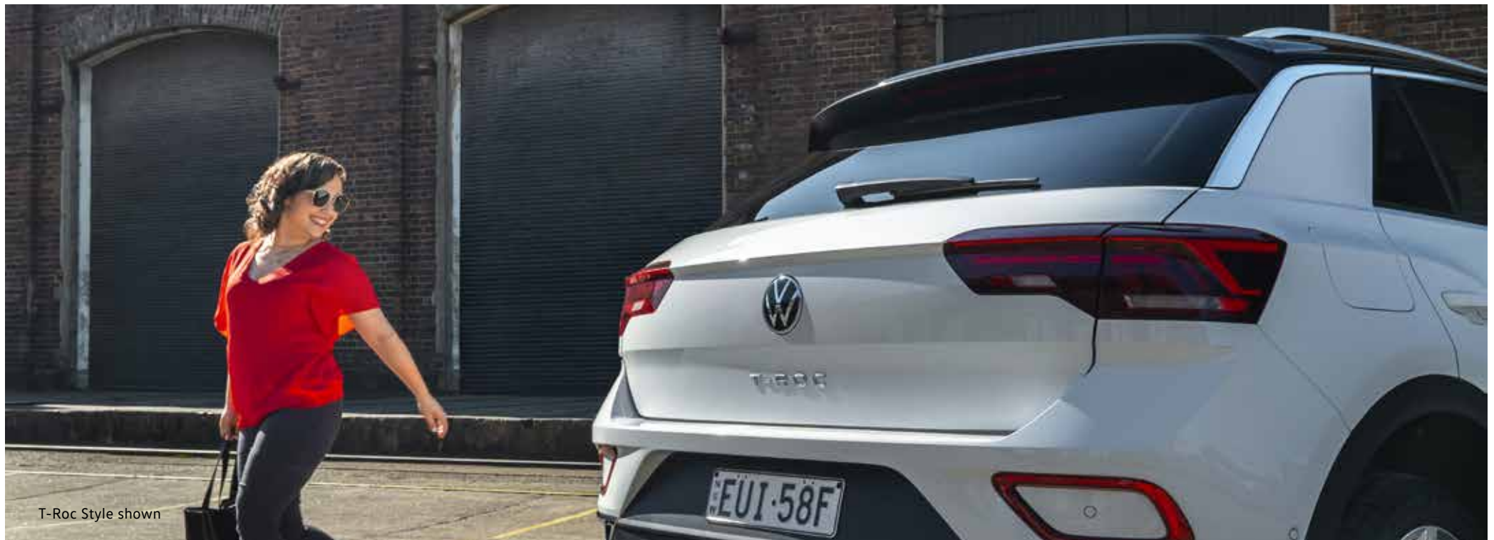
T-Roc Style shown