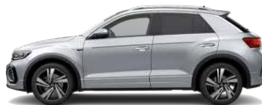
Pyrite Silver M