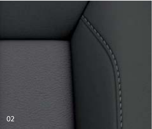
01 Black-Anthracite microfleece seat upholstery 02 Grey-Black Vienna leather appointed seat upholstery