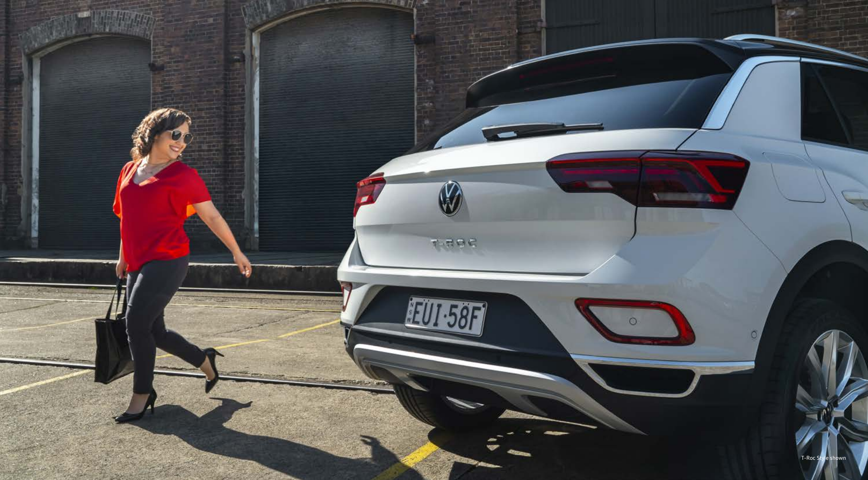
T-Roc Style shown