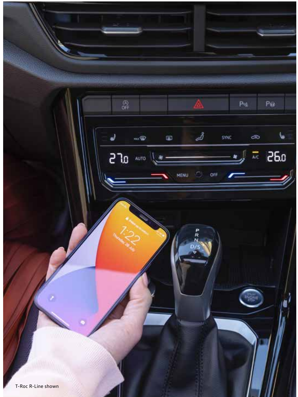
T-Roc R-Line shown

~Leather appointed seats have a combination of genuine and artificial leather, but are not wholly leather.