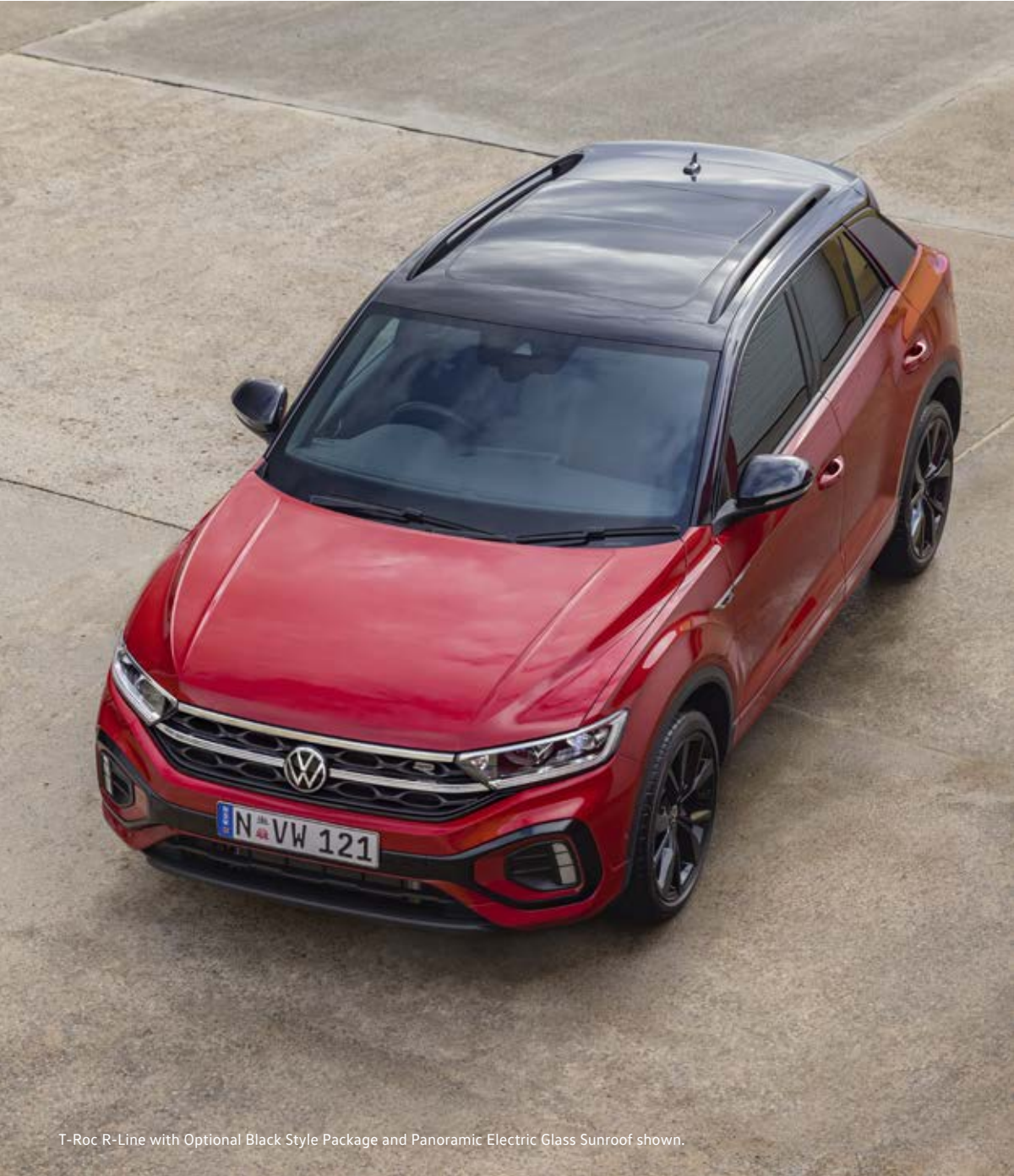
T-Roc R-Line with Optional Black Style Package and Panoramic Electric Glass Sunroof shown.

An optional Leather Upholstery Package is available for the T-Roc Style. Nestle into luxurious surrounds with Vienna leather appointed upholstery ^ . Front seats are able to be heated when the package is selected, and an electrically adjustable driver's seat with memory makes it easy to find and store an optimal driving position.