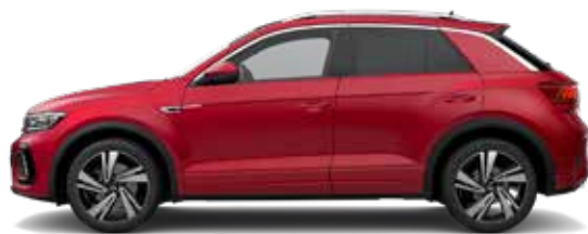
Kings Red PM