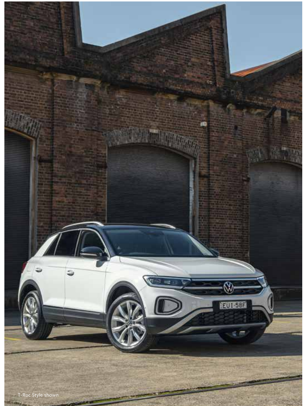
T-Roc Style shown