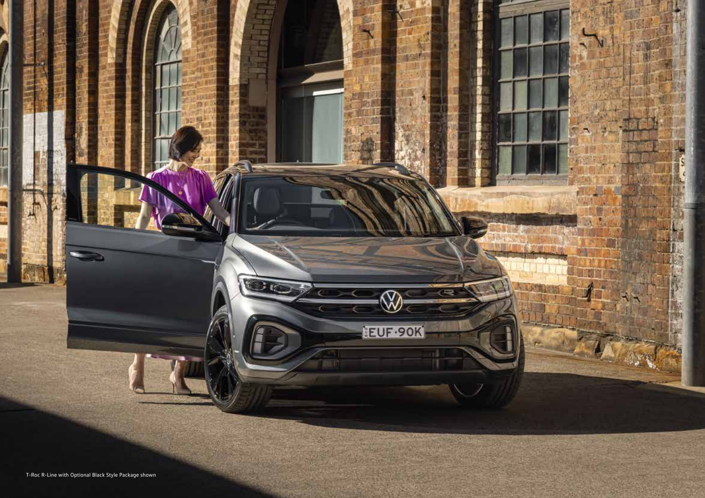
T-Roc R-Line with Optional Black Style Package shown