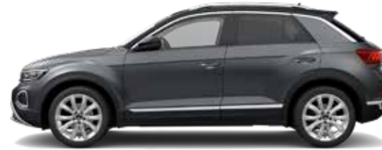
Indium Grey M