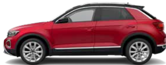
Kings Red PM