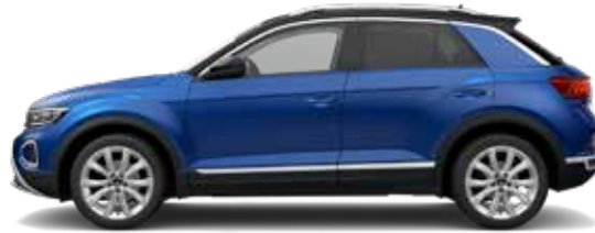
Ravenna Blue M