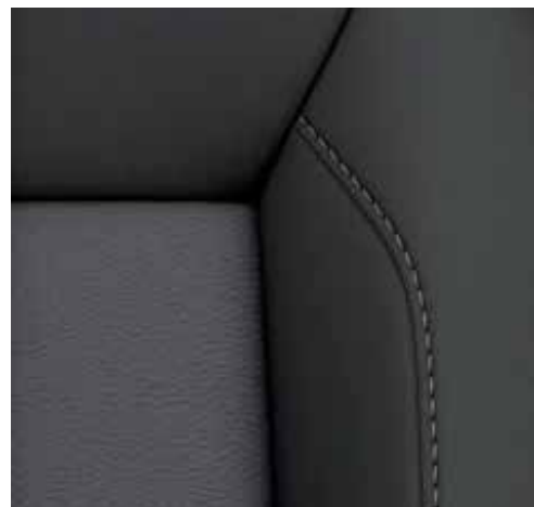
Style Grey-Black Vienna leather appointed seat upholstery

Leather appointed seats have a combination of genuine and artificial leather, but are not wholly leather.