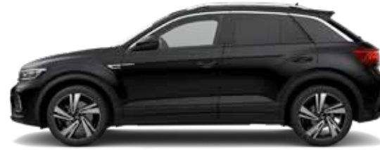
Deep Black PE