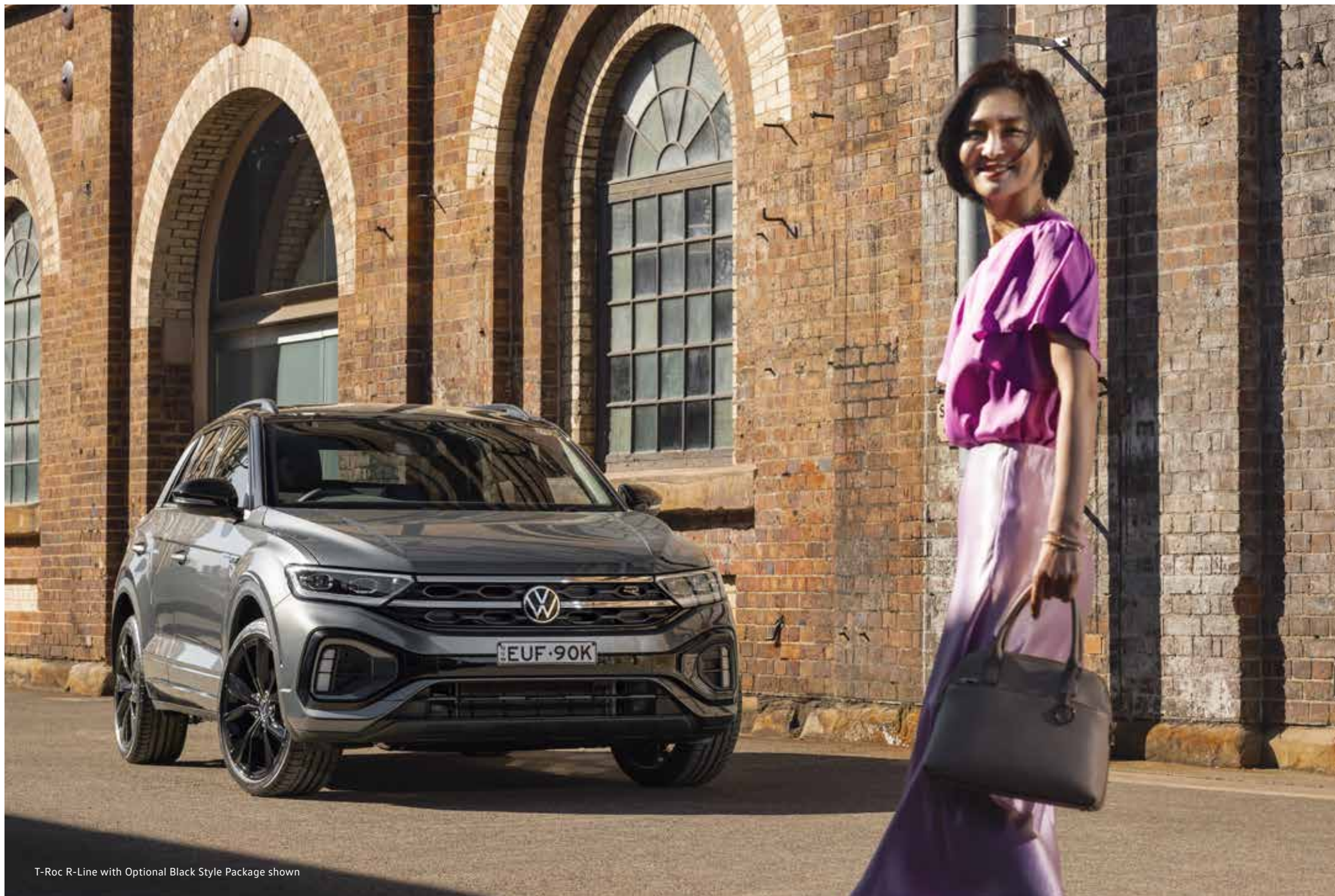
T-Roc R-Line with Optional Black Style Package shown