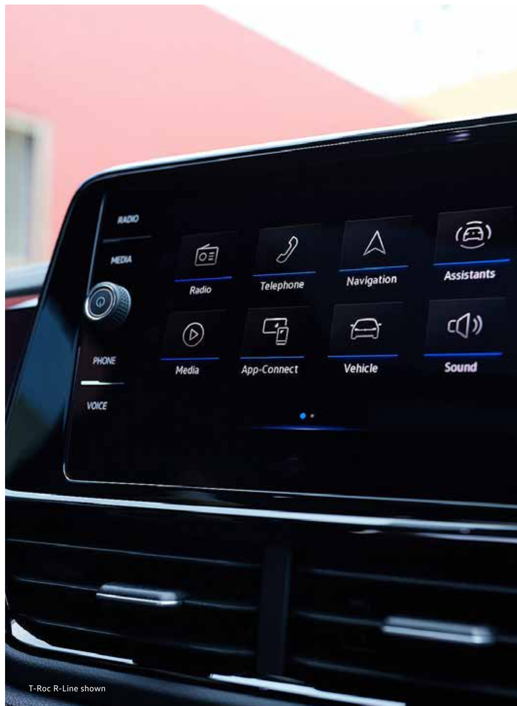
T-Roc R-Line shown

S Standard O Optional - Not Available P Package