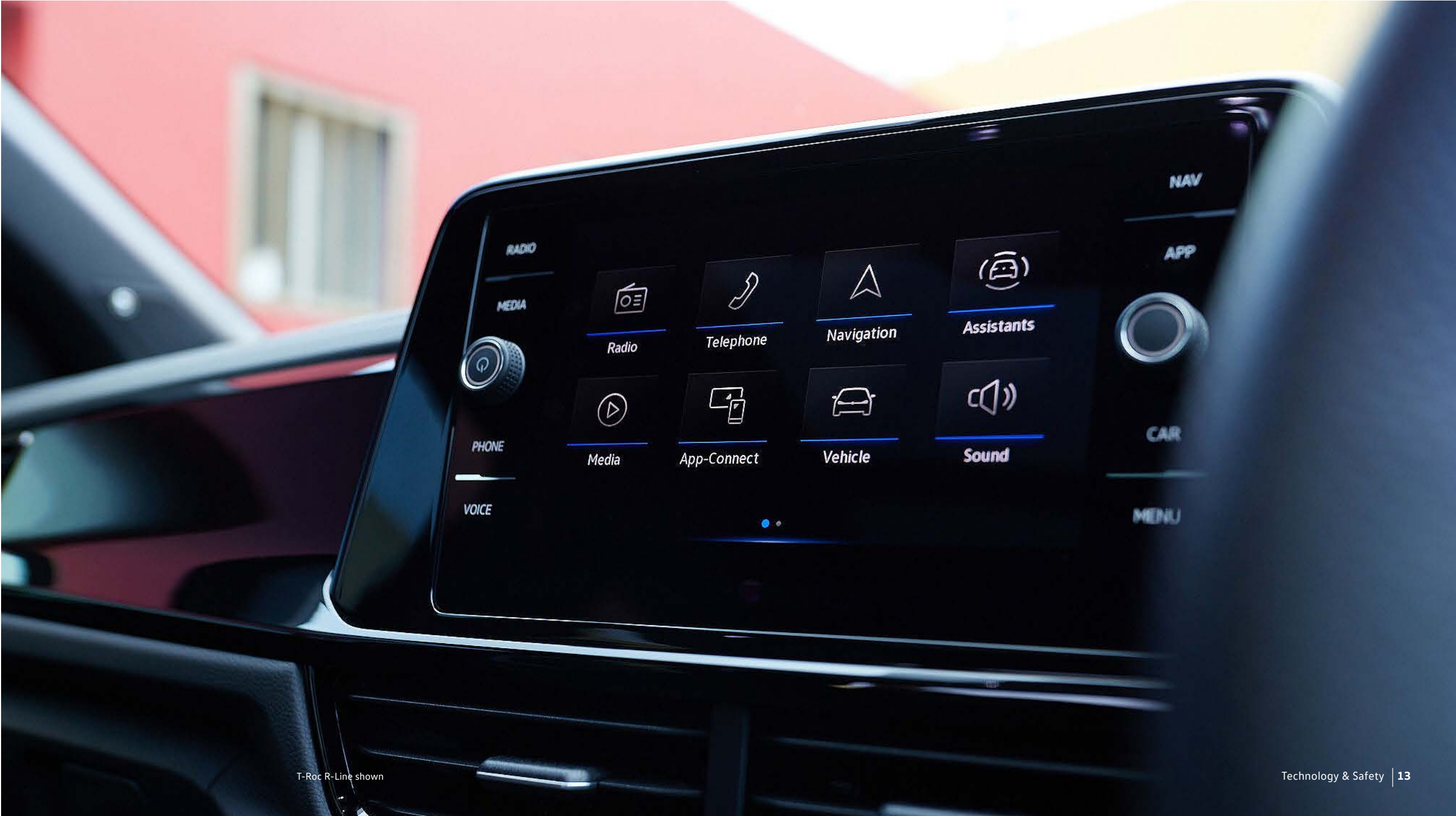
T-Roc R-Line shown